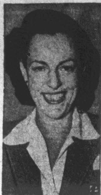
SOLON—Rep. Helen Gahagan Douglas, California democrat, smiles for the cameraman at Washington.