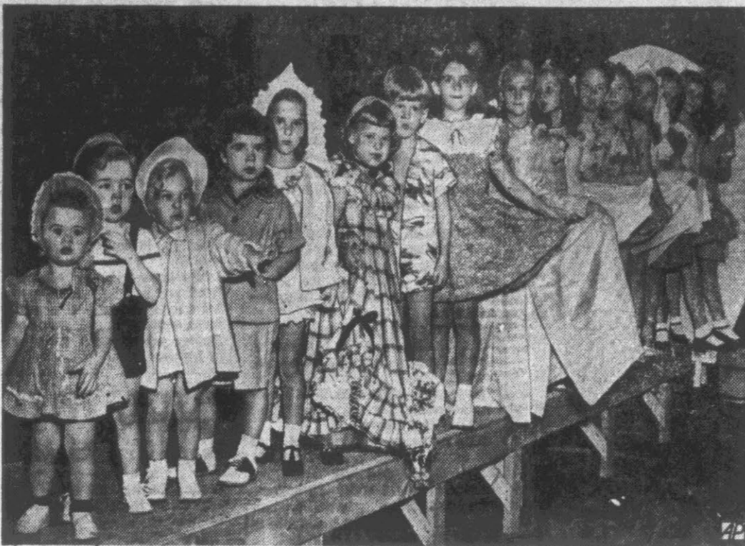
LITTLE STYLE MODELS—Child models from two (left) to 10 (right) years old wear latest creations of California designers at a children's fashion show in Los Angeles.

FLANAGAN'S SERVICE DEPARTMENT SO I TOOK HER DOWN THERE—AN—AN—