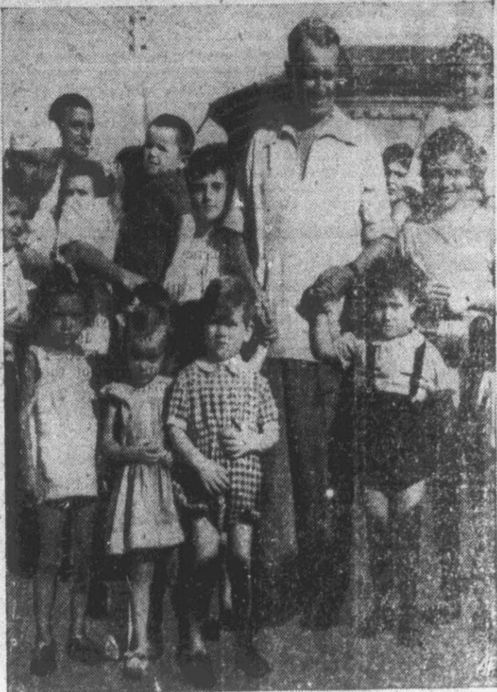
SINGS FOR PATIENTS—Maurice Chevalier, French entertainer, stands among young patients at the Pasteur Institute in Nice, for whom he sang on a recent visit.

A labor department tabulation today showed there are only nine strikes over the entire nation where 1,800 men or more are idle. The biggest is the east coast shipyard strike with 35,000 idle.