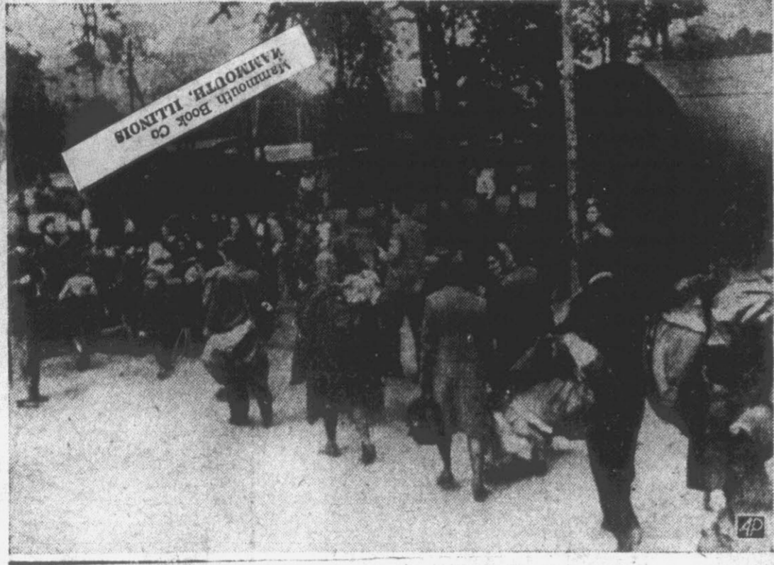
Long lines of Jewish refugees move past Nissen huts upon their arrival at Poppendorf Camp near Luebeck, Germany, at the end of their ill-fated attempt to migrate to Palestine. British troops removed them from the S. S. Exodus of 1947 off the Palestine coast and brought them back to Germany. This group was returned on the S. S. Ocean Vigour. Many wanted and British troops forcibly removed them, using clubs and fire hose to get them off the ship.