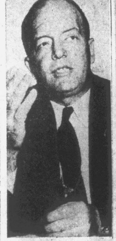
Harold E. Stassen, former governor of Minnesota, tells newsmen at a press conference in Washington that he will enter the Wisconsin presidential preference primary next April in quest of the Republican nomination for the presidency.