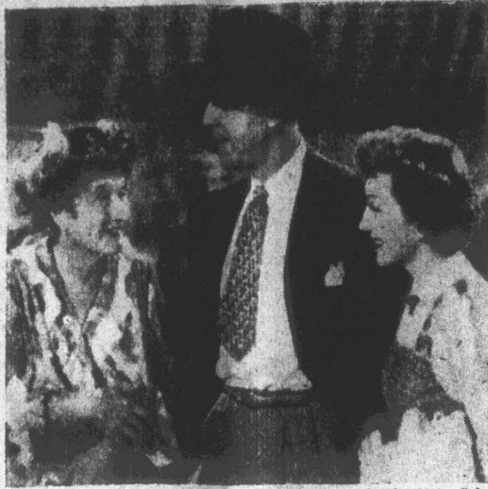
Marjorie Main pictured with Fred MacMurray and Claudette Colbert in scene from the clever movie "The Egg and I" at the Pitt three days, starting today.

presented a corsage of white gladioli and gifts of china, silver, and crystal in her chosen patterns.