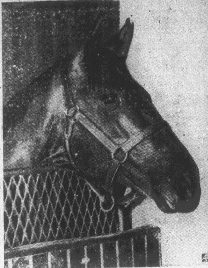
$45,000 YEARLING —This dark bay colt by Bull Dog out of Spotted Beauty brought $45,000 on the last day of the yearling sales at Keeneland, Kentucky. It was bought by Jaclyn stable of California.