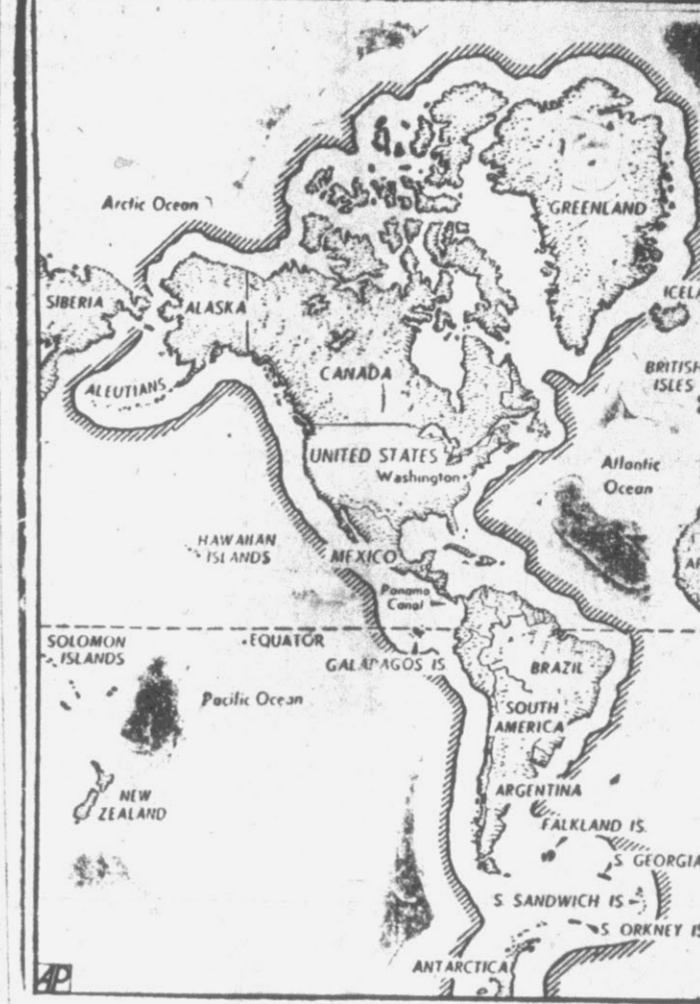
Shaded outline indicates area in western hemisphere from Arctic to Antarctic, which will be included in hemispheric "security region" guarded by guns of all the American republics under a plan approved at Quintandinha, Brazil, by a 14-nation subcommittee of the Inter-American Conference.