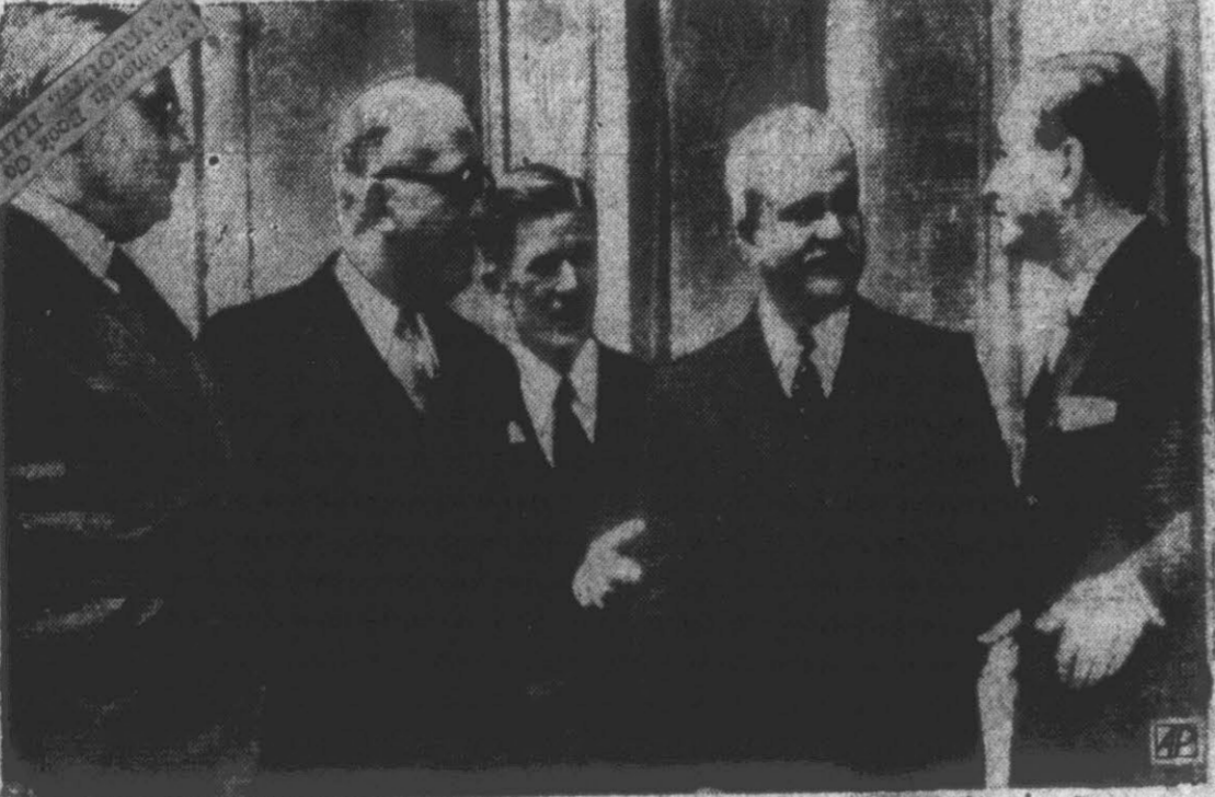
French, British and Russian representatives chat in Elysee Palace of Paris after a luncheon given by President Vincent Auriol of France for the Big Three foreign ministers conferring on the Marshall Plan for Europe. Left to right: Great Britain's Ernest Bevin, President Auriol, an unidentified Russian interpreter, V. M. Molotov, Russia's foreign commissar, and Georges Bidault of France.