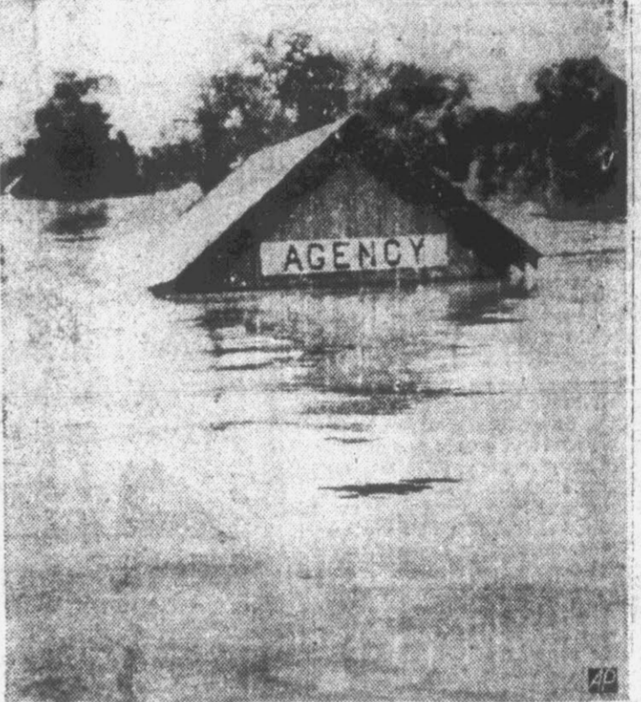
Only a bit of the roof and the name plate on the railroad station at Agency, Mo., are visible above flood water of the Platte river which runs eight to 10 feet deep over the town in the northwestern part of the state.