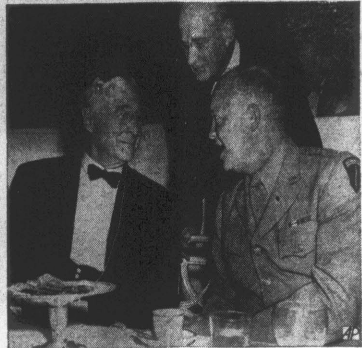
TABLE CONVERSATION—Gen. Dwight D. Eisenhower, (right) U. S. Army chief of staff, talks with Bernard Baruch (left) at the annual Wings Club dinner in New York. The kibitzer is Herbert Bayard Swope.