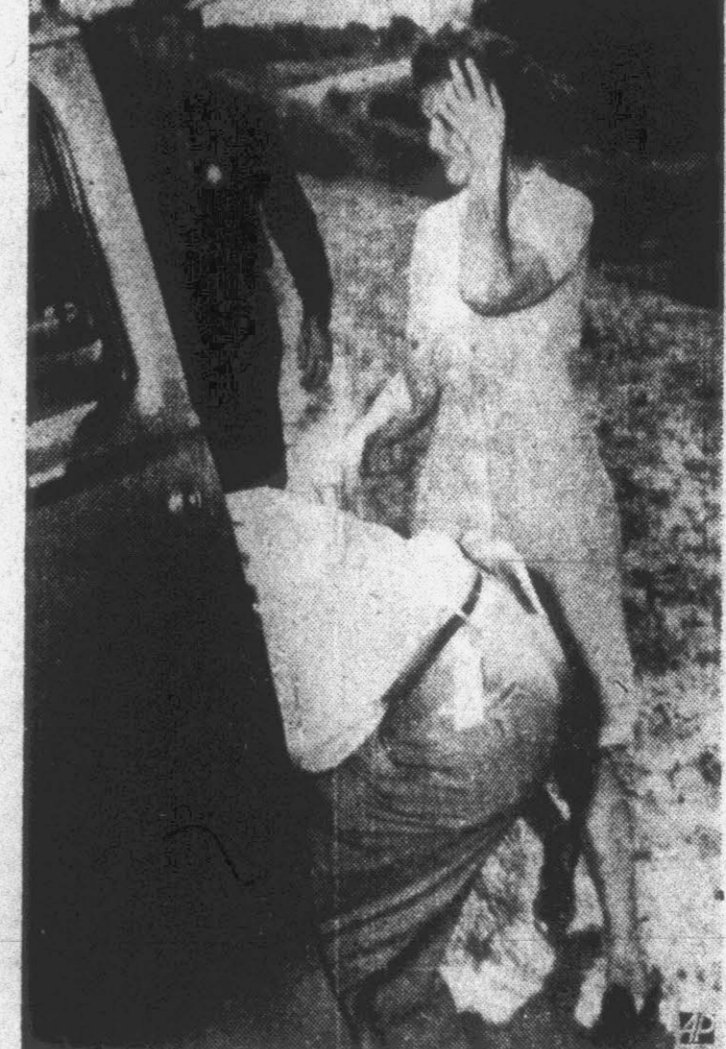
Winnie Ruth Judd (right), the mad trunk murderer, is recaptured on the desert near Phoenix, Ariz., 12 hours after she escaped from the state hospital for the insane. The officers taking her into custody were not identified. It was her third escape from the asylum to which she was committed after killing two women friends and shipping their dismembered bodies to Los Angeles in trunks in '31.