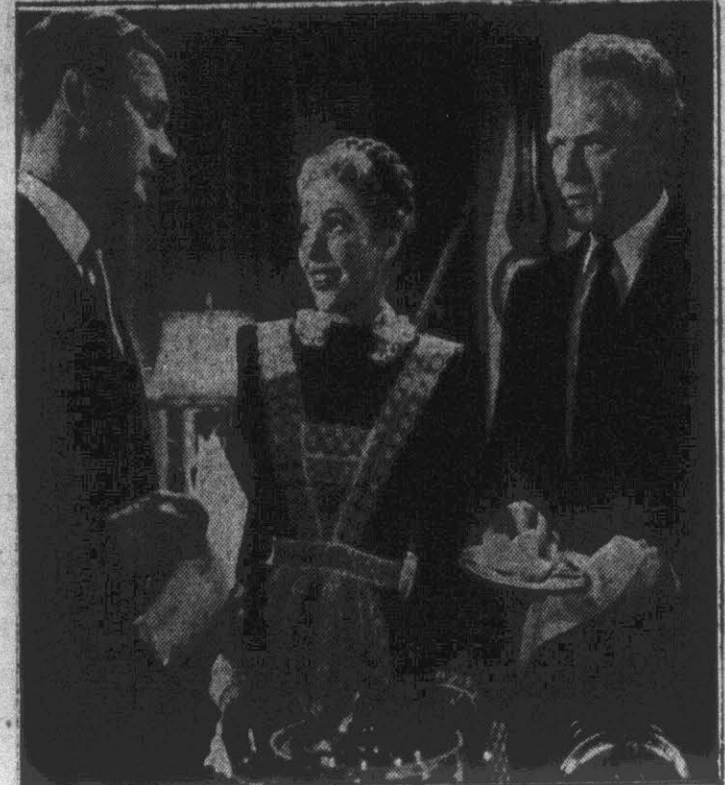
Loretta Young, as young housemaid enters Joseph Cotten a bit of advice with disapproval of Charles Bickford in scene from delightful movie coming to the Pitt Sunday-Monday.

or poor of all nationalities. What an enormous body of individuals are filling the galleries of literature.