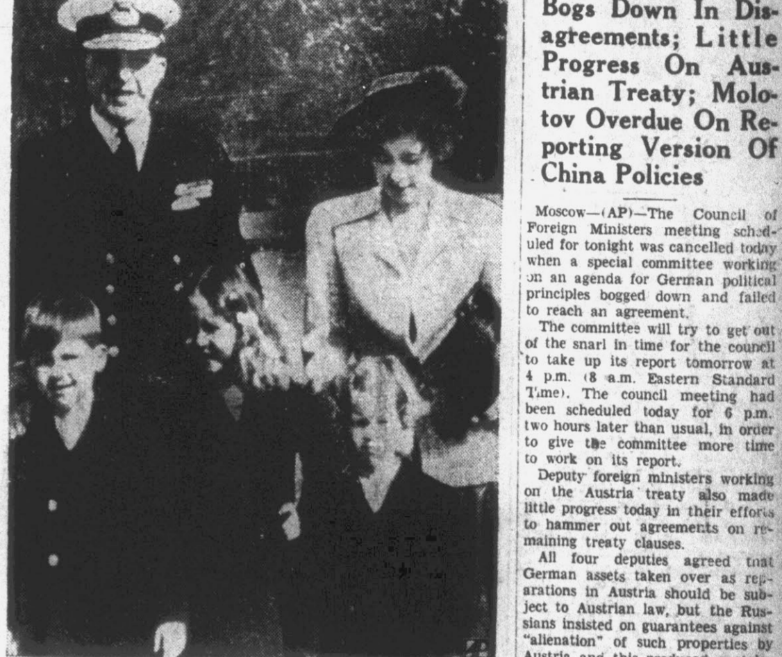
Here is King Paul, the new monarch of Greece, with his wife, Queen Frederika, and their three children: Crown Prince Constantine, Princess Sophia, and Princess Irene. Paul was called to the throne after his brother, King George II, died unexpectedly of a heart ailment April 1.

Washington, April 4—(AP)—The army will begin distributing soon its meritorious service medals to World War II veterans and occupation medals to eligible soldiers and veterans.