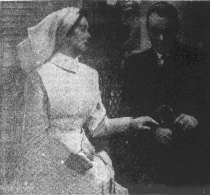
Love is sacrificed when Elizabeth Kenny explains to Dean Jagger why she cannot marry him. Scene is from stirring drama "Sister Kenny" opening Sunday at the Pitt.