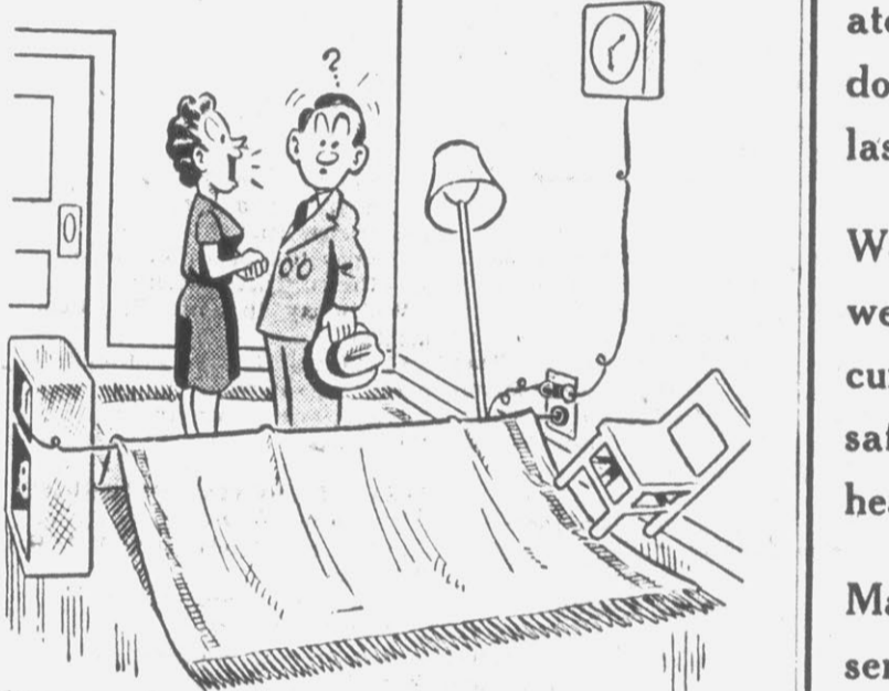
"OH, THAT? WE HAVE ONLY ONE SOCKET IN THE ROOM--AND THE RADIO CORD IS A BIT SHORT."

Don't overload your wiring system. When you build or modernize provide ADEQUATE WIRING.