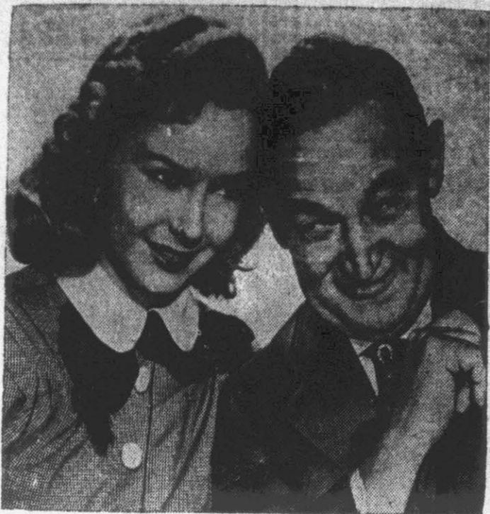
Diana Lynn and Barry Fitzgerald are co-starred with Sonny Tufts in "Easy Come, Easy Go" Pitt today and Thursday.