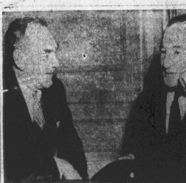
Lord Inverchapel (right), British ambassador to the U. S., and Acting Secretary of State Dean Acheson (left) discuss Greek problems in a conference at the State Department in Washington.