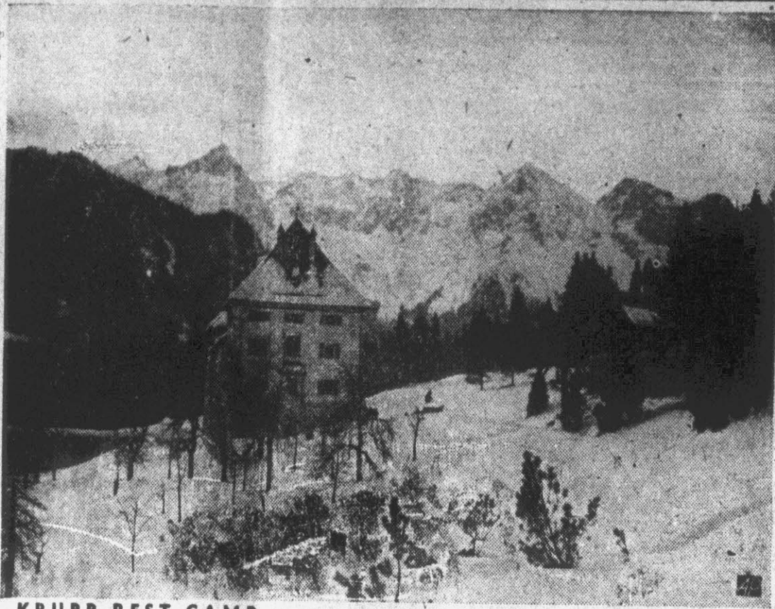
KRUPP REST CAMP —Blennbach Castle in Austria, containing 45 rooms and formerly owned by the Krupp arms-making family, is now a U. S. Army officers' rest camp.