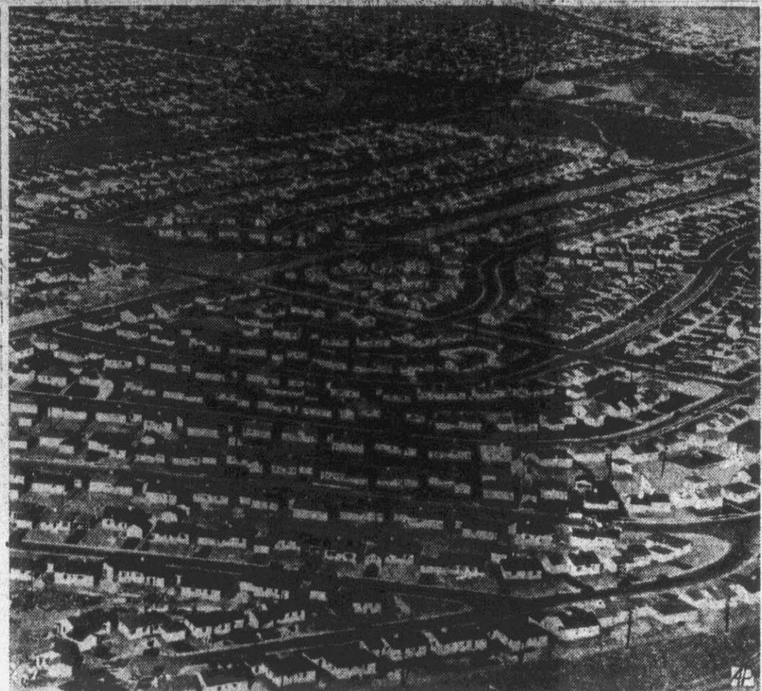
NEW G.I. HOME COLONY—Aerial view of the housing project at Los Angeles where Henry J. Kaiser has laid out 10,000 prefabricated homes for families of veterans.

est and dividends paid you; and maybe a tip from someone to watch your return for fraud. So the copy of your return, sent to New York by your collector, is checked against the other information in your file there.