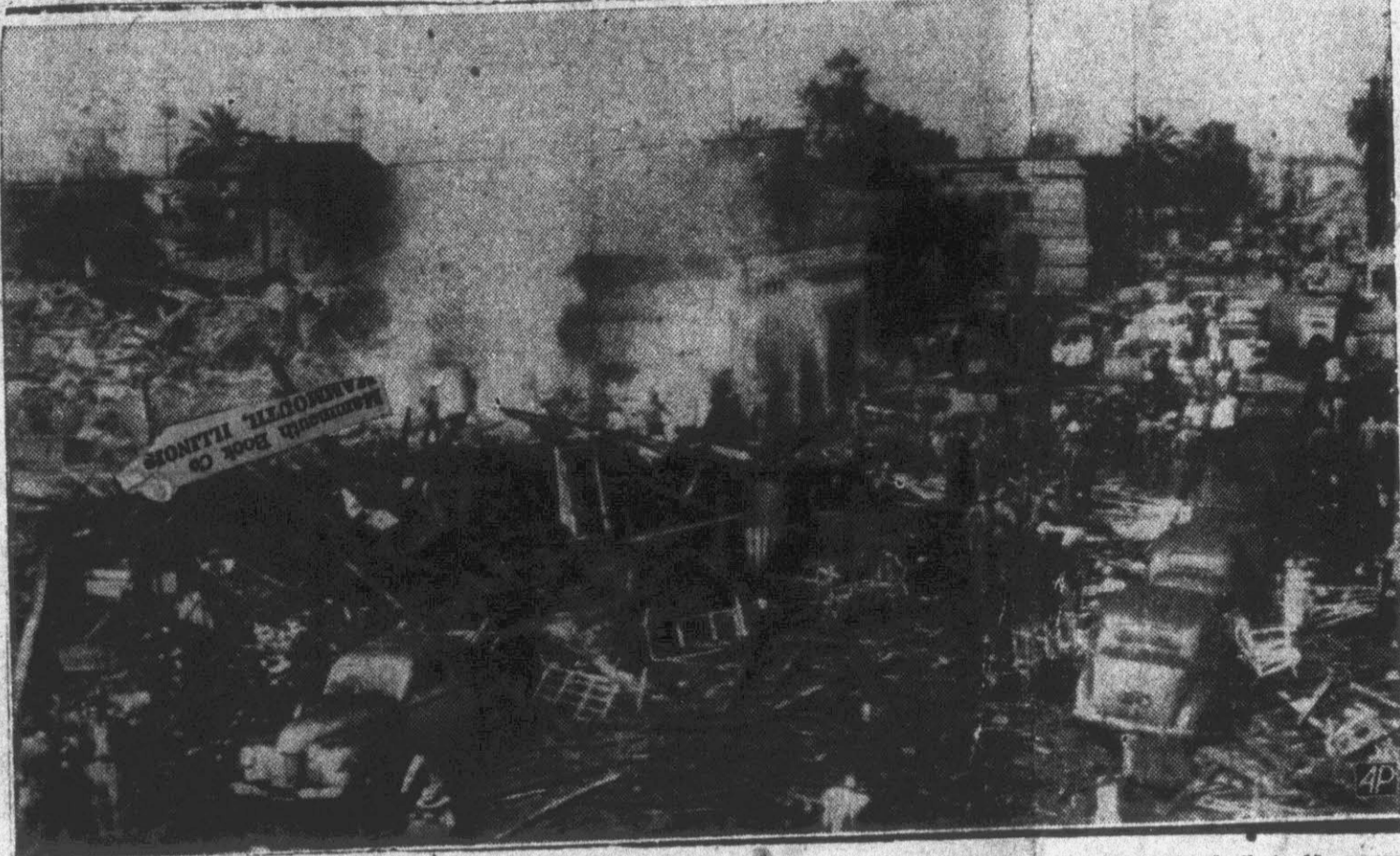
Rescue workers gather to begin searching the smoking ruins left by a mammoth explosion in Los Angeles that brought death to 15 persons and injured more than three hundred others.