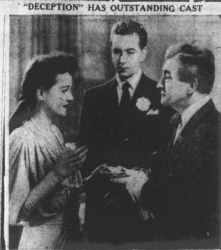
Bette Davis, Paul Henreid and Claude Rains have stellar roles in romantic drama at Pitt Sunday-Monday.