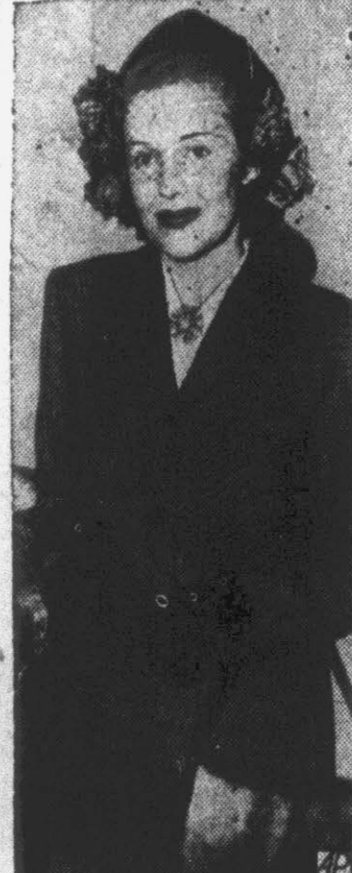
ACTRESS —Madeleine Carroll of the films poses after arriving in U.S. on the Queen Elizabeth from England.

program is proceeding satisfactorily. Some of this work was held up while the Utilities Commission installed water, gas and drainage facilities. Already 15 blocks of new streets have been opened up and graded. The good work goes on.