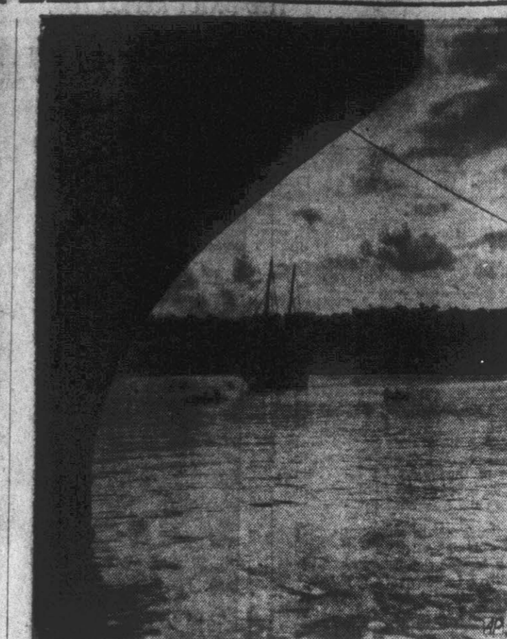
BEIRUT VIEW — The harbor of Beirut, Lebanon, is framed by the bow of the aircraft carrier Randolph as units of the U.S. fleet visited the city during a tour of the Mediterranean.