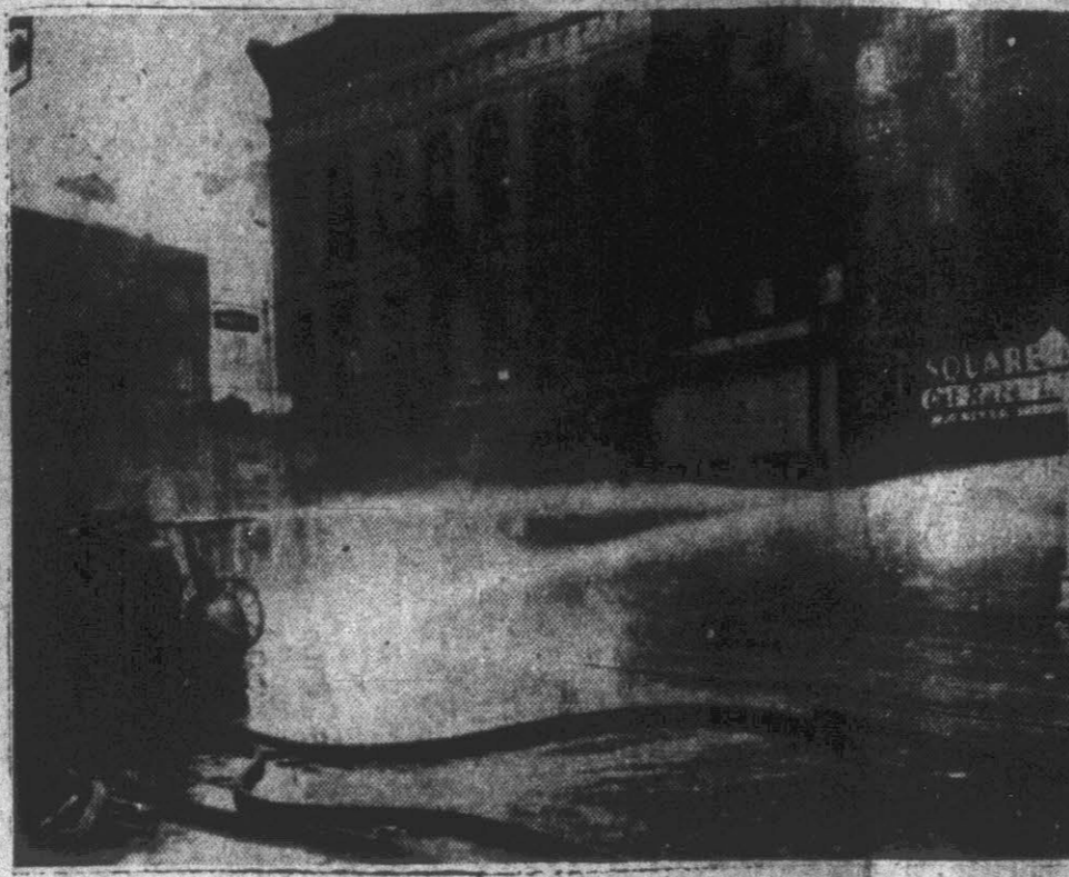
Firemen stand at a safe distance from nauseating chemical fumes as they pour water into a burning drug store at Atlanta, Ga., during an eight-hour battle with the stubborn flames inside the building only a few blocks from the Wincoff hotel which burned December 7 with the loss of 119 lives.