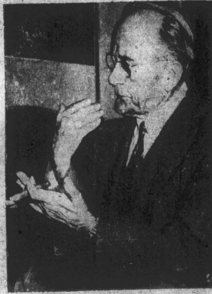
U. S. Senator Theodore G. Bilbo of Mississippi sits in his home at Poplarville, Miss., and protests "I have done no wrong." He is talking to reporters who questioned him about the two-way senate investigation of his activities in his recent campaign for re-election.