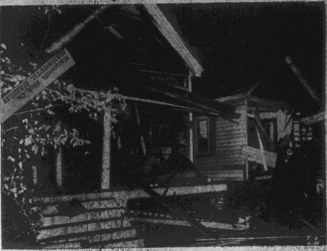
Fifty yards from the center of the blast, these houses were partially wrecked by a gas explosion which wrecked the Ideal Laundry plant. It killed at least five persons and injured about 50 in Greenville, S. C. (AP photo).