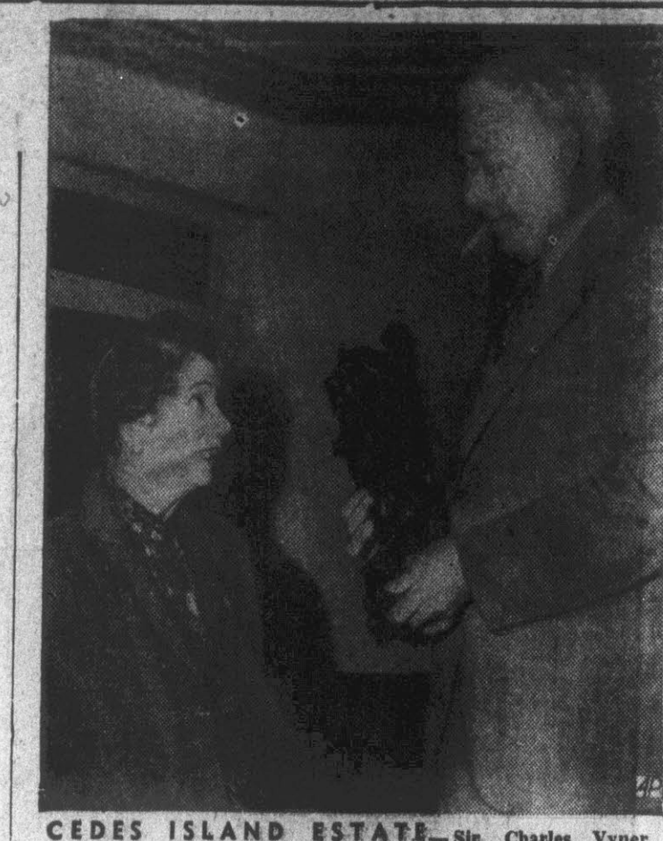
CEDES ISLAND ESTATE —Sir Charles Vyner Brooke, "white rajah" of Sarawak, shows his wife, the rane, a Chinese god in their London home. Brooke has ceded Sarawak, which his family ruled for 100 years, to Britain.