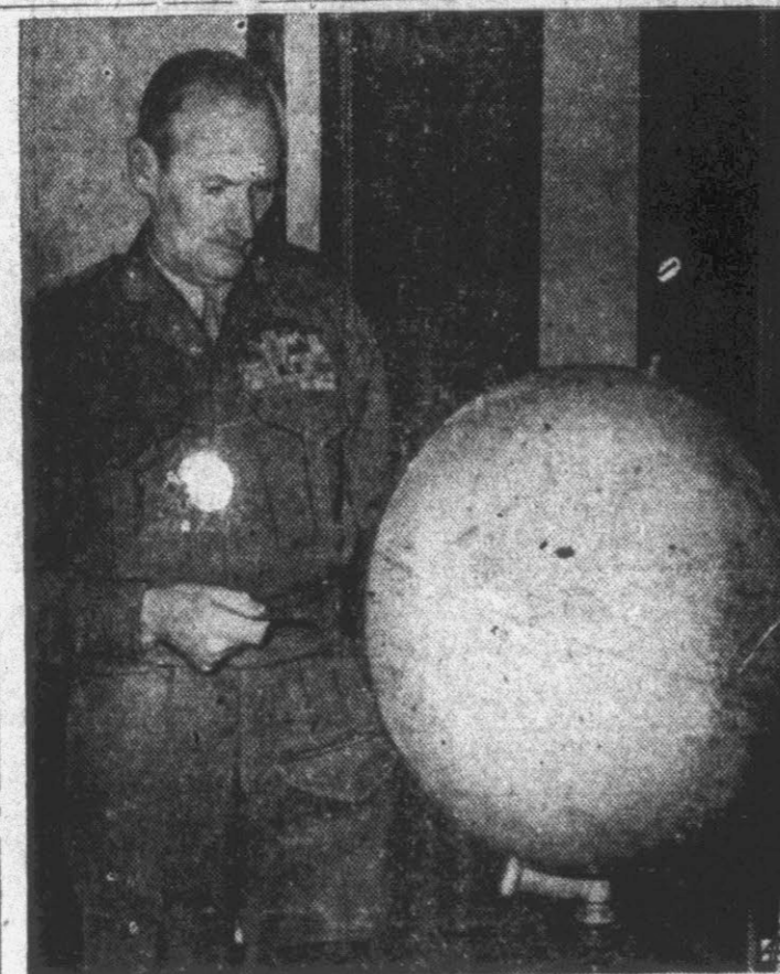
MONTY NEW STAFF CHIEF —Field Marshal Viscount Montgomery, new chief of the Imperial General Staff, scans a world globe in his office at Whitehall, London.