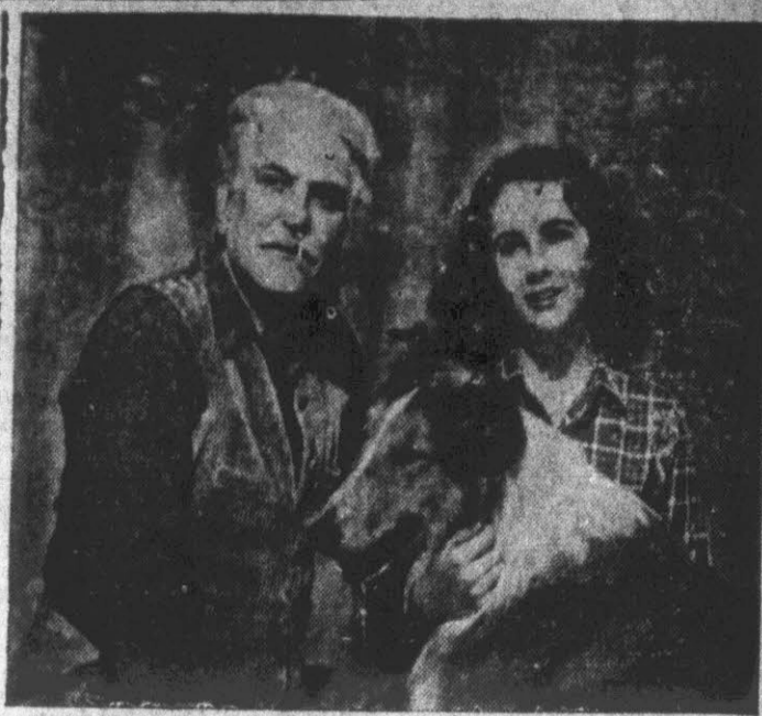
Filmed in technicolor amid nature's wonderland "Courage of Lassie" with cast headed by Frank Morgan opens at the Pitt Tuesday.

"With the President's high ideal in mind, I'm sure that there will be no lack of cooperation between the parties. We like the President's words. We hope that the conduct of his office will square with his ideals."