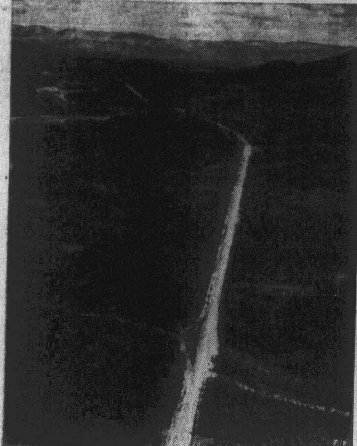
ALASKAN AIRVIEW —This airview of a section of the Alaskan highway north of Whitehorse, Yukon Territory, Canada, illustrates the spectacular 1,600-mile roadway which is being prepared for civilian traffic by the Canadian Army.