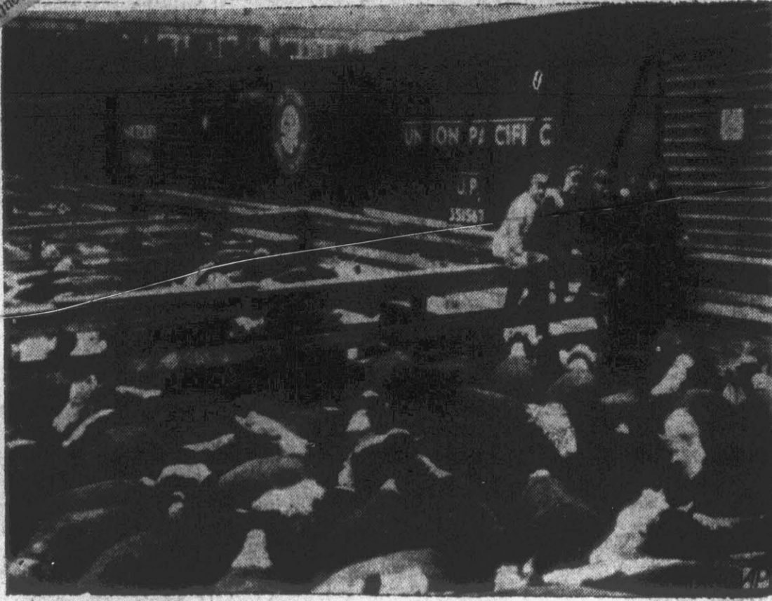
Cattle are filling the pens of Chicago's Union Stockyards again after removal of the OPA ceiling price on meat. Pens in this picture are jammed. The head-end of train in the background is loaded with livestock because of the jam, the train crew men, sitting on the fence, had to wait three hours before they could get the cattle cars moved up to the unloading pens. Some choice steers were sold at a record-breaking price of $37.50 per hundred weight.