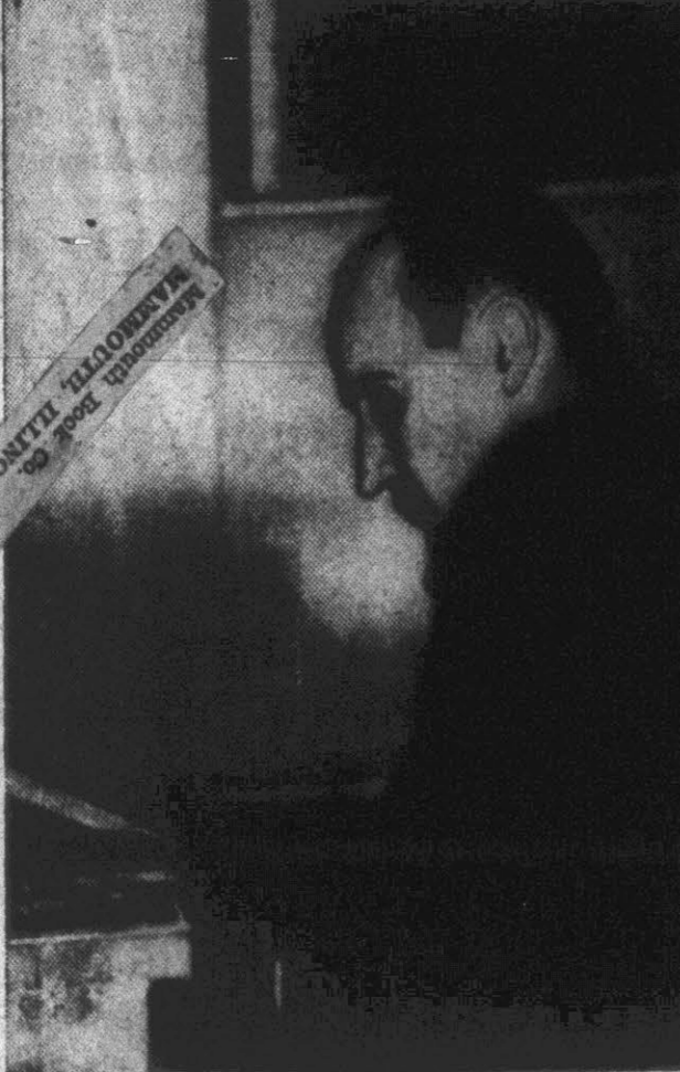
Archbishop Alojzije Stepinac, head of the Roman Catholic church in Yugoslavia, sits in his jail cell at Zagreb, Yugoslavia, where he was tried by a three-man people's court on charges of collaborating with German and Italian authorities and the outlawed Croat Ustashi. The archbishop did not make any plea for mercy during the trial which ended October 8.