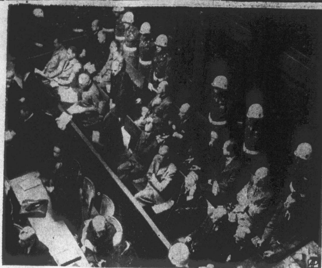
ON TRIAL AT NUERNBERG —The war crimes trial at Nuernberg, Germany, of the leaders of the Nazi regime heard cases against these men, shown in the prisoners' dock (left to right): front row, Hermann Goering, Rudolf Hess, Joachim von Ribbentrop, Wilhelm Kettel, Alfred Rosenberg, Hans Frank, Wilhelm Frick, Julius Streicher, Walter Funk, Hjalmar Schacht; back, Karl Doenitz, Erich Raeder, Baldur von Shirach, Fritz Sauckel, Alfred Jodl, Franz von Papen, Arthur Seyss-Inquart, Albert Speer, Constantin von Neurath, Hans Fritzsche.

(Continued from Page One) manently from Germany. Byrnes must have killed it, diplomats agreed. He said the U. S. would support the apparent desire of the people of those two industrially rich areas to remain united with the rest of Germany.