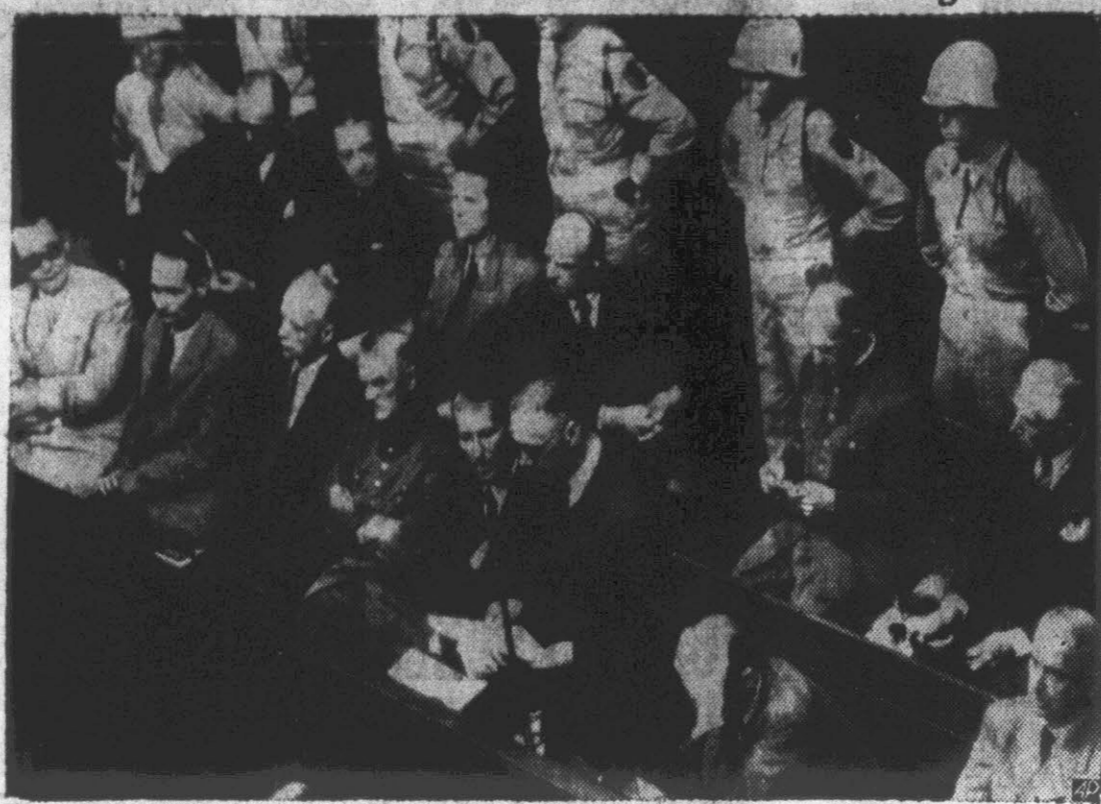
Dr. Alfred Rosenberg, Hitler's racial theory exponent, stands before the microphone in the court room at Nuernberg, Germany, to make his final speech as the trial of Nazi leaders on war crimes charges nears the end. Other defendants, left to right on front row, are Hermann Goering, Rudolf Hess, Joachim von Ribbentrop, Field Marshal Wilhelm Keitel, Ernst Kaltenbrunner, Rosenburg, Admiral Karl Doenitz, Grand Admiral Erich Raeder, Baldur von Schirach, Gen. Fritz Sauckel, Gen. Alfred Jodl, and Franz von Papen.