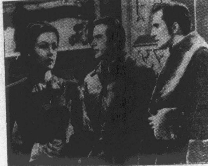
Tierney with Glenn Langan and Vincent Price in scene from the emotional drama "Dragon Wyck" opening tomorrow at the Pitt.

The intense rivalry between the Brooks and the Cards began five years ago with the two clubs battling it out until the Dodgers clinched the championship two days before the season ended. The Cards turned the tables on the Dodgers the following year but had to wait until the last day of the season before they were assured of victory.