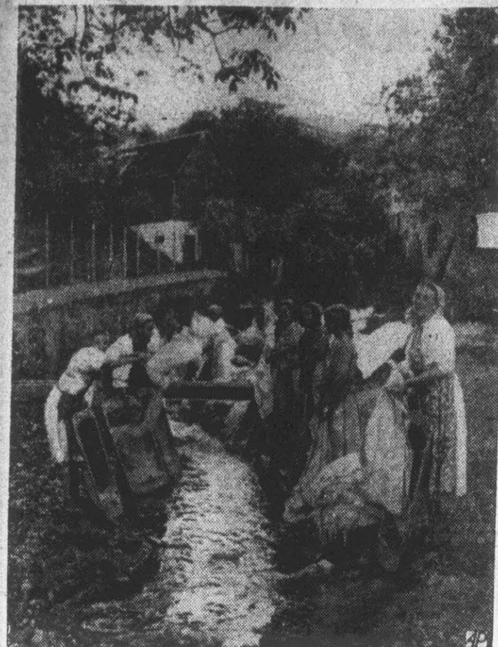
YUGOSLAVIAN WASHDAY -These women are washing their clothes in the same manner as their forebears in Sestine, near Zagreb, Yugoslavia. The laundered clothes are carried home on boards on the women's heads.