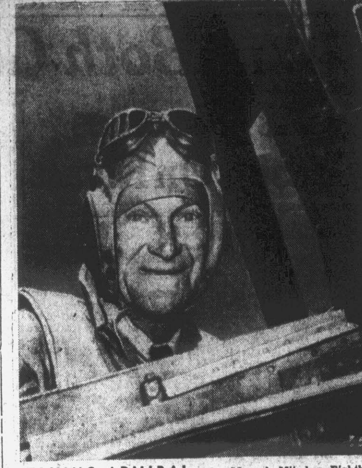
FLYING ADMIRAL —Adm. Marc A. Mitscher, Eighth fleet commander, sits in the after cockpit of a Helldiver on the carrier Franklin D. Roosevelt after returning from an aerial reconnaissance during fleet maneuvers.