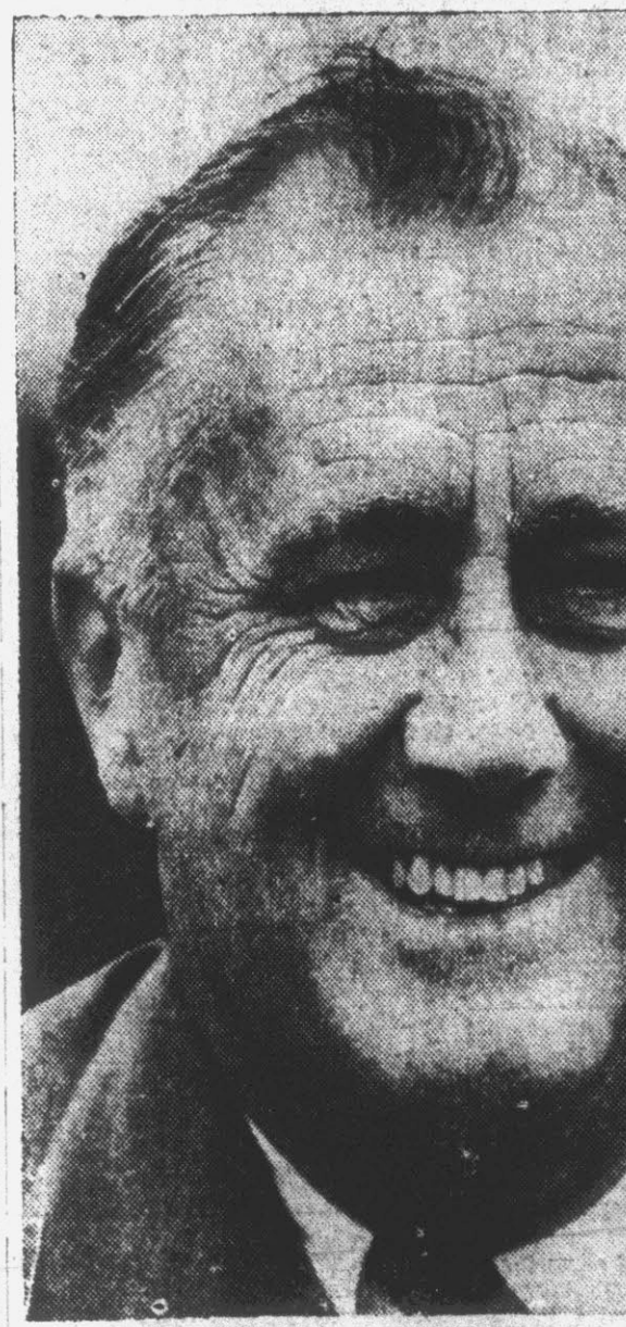
FRANKLIN DELANO ROOSEVELT

Born January 30, 1882; was a victim of the dreaded Infantile Paralysis; overcame his physical handicaps and rose to be the most popular president our nation has ever known, as well as one of the greatest statesmen of all times. He fought against depression, oppression and poliomyelitis. He died April 12, 1945.