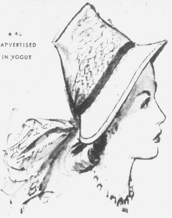
"BERMUDA" by STETSON...$11.95

Brand-new look for a brand-new season: the pale coolness of Stetson cone crown above a Spring suit! (Light colors slightly higher.)