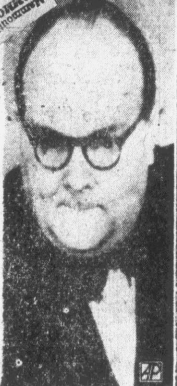
Paul Henri Spaak, Belgian Foreign Minister, elected President of the United Nations General Assembly at its opening session in London, January 10, is shown (above) as he presided over the proceedings at Central Hall, Westminster, Jan. 14. (AP Wire-photo).