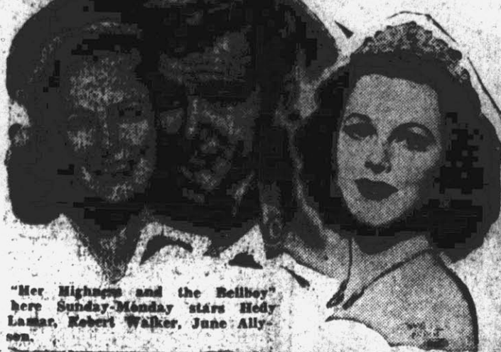
"Mer Highness and the Bellboy" here Sunday-Monday stars Hedy Lamarr, Robert Walker, June Allyson.