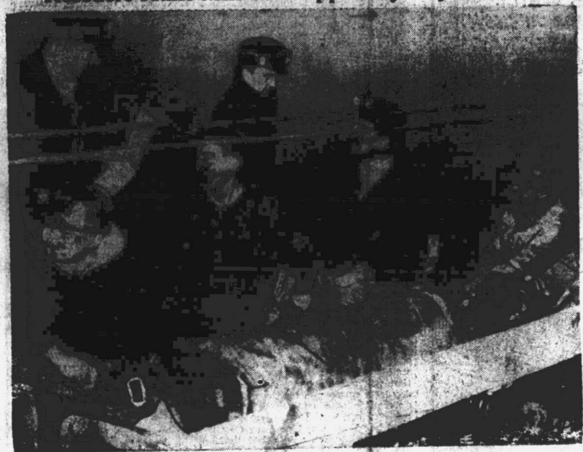
These rescue workers return to the surface in a tram car to obtain more rock dust used in fighting fires in the tunnels after an explosion had trapped between 30 and 50 miners in the Straight Creek Coal company near Pineville, Ky. Veteran miners expressed doubt that any of the trapped men remained alive.