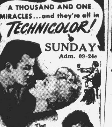
The TECHNICOLOR genie with light brown hair!

A THOUSAND AND ONE MIRACLES...and they're all in TECHNICOLOR!