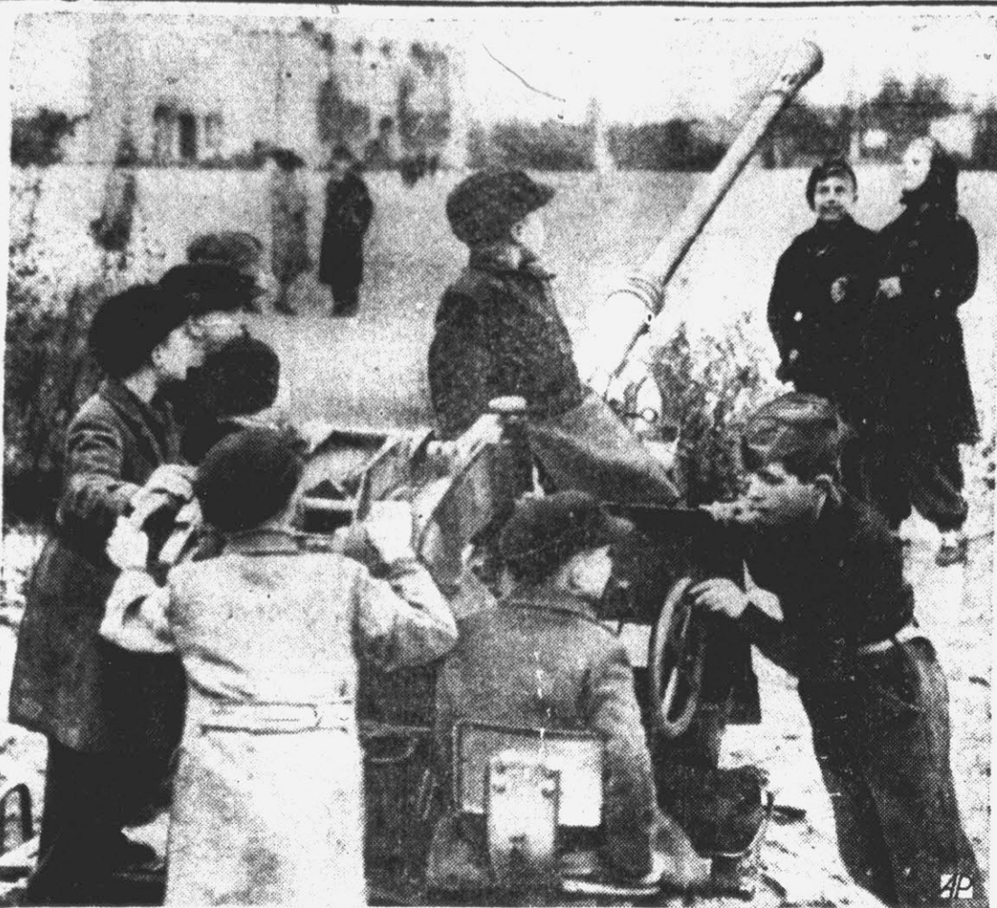
STILL PLAY SOLDIER—A group of German children play at the game of soldiering with an old anti-aircraft gun located near the center of Berlin.

A trainer type airplane struck telephone and electric power lines and crash-landed into a field, disrupting telephone service for two hours and imposing a one-hour blackout in nearby homes.