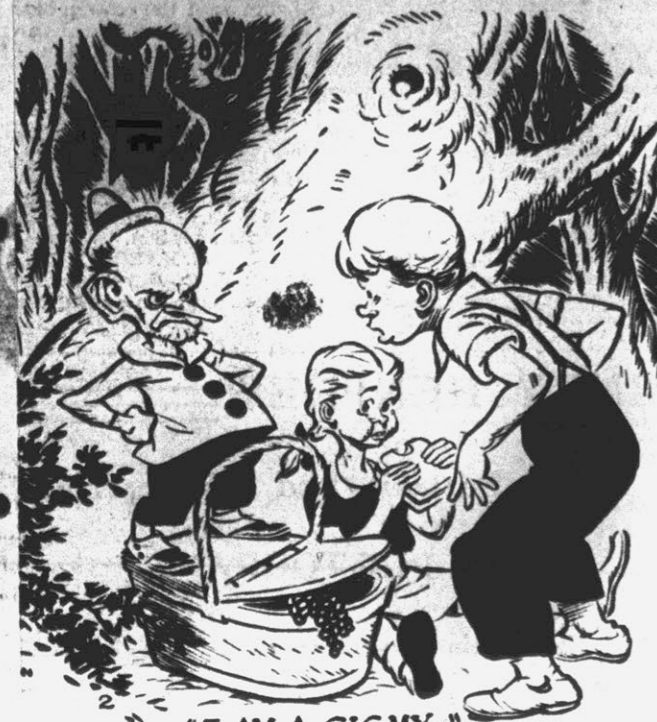
"I AM A GIGMY."

Chapter 3 David loses his bunny minute there was not a minute that forest as David with disbelief at the small bunny by his side. Then he his feet and threw himself gily gummy." her back!" he shouted. "er back or I'll choke you die!" ie gummy wiggled out of his easily as water would have through his fingers and p a fit tree. ou don't believe in Santa d Gummies and Mag?" he "Well, think it over. If the t broken in three weeks cious sister will turn into a lopotamus and a white anas she will be forever- en the horrid creature burst ighter, shimmied down the i vanished into the forest; with misery, the little boy up the white bunny and his face against the soft r. shall I do, little sister? all I do? he wept. But the ould only nuzzle deep inside collar and look at him plead- th her soft eyes. ant had finally sunk beyond ant mountains and a void is blowing through the for- bunny began to shiver so- pened his jacket and car- ced the bunny inside. "Don't he whispered. "I'll think of g." And he hugged her close ough she had been his sis- the world I guess there was e unhappy boy than fair- David. "Because it's all my ie thought wretchedly. "Now nothing for it but I must nta Claus and ask him to e spell." of course, it had never been at he had not believed in laus. He truly felt that San- the one good thing in the nd that he could break any