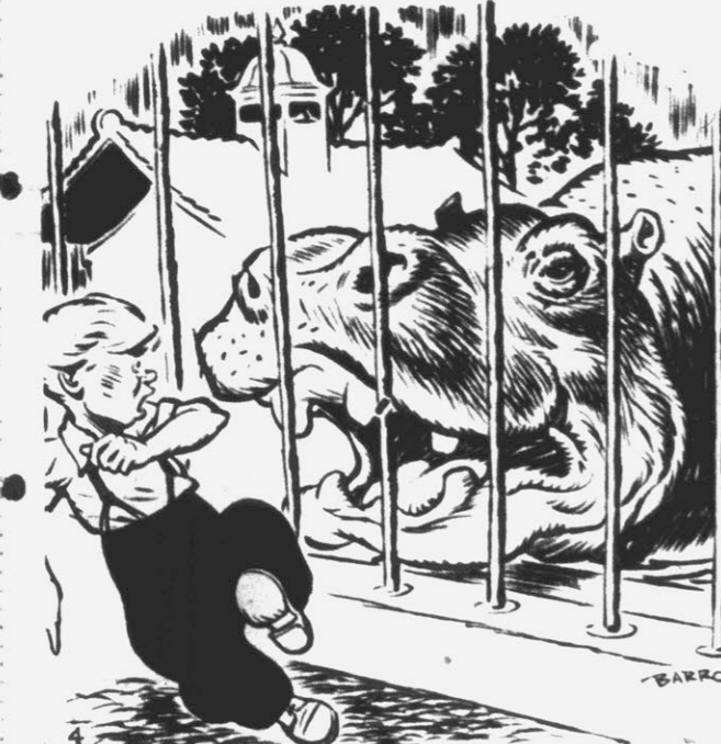
"NO! NO!" CRIED THE BOY IN HORROR.

CHAPTER 4 David Goes to the Zoo David soon realized that his pleas- townspeople were useless so- pel away and secretly made y to the Zoo. a place it was! It stretched res of land and as the boy ough the gates he felt that it be hours before he found bility. First there were the n great out door cages and te swimming pool for each. Then the duck ponds and a ool for black seals. e was an elephant house and fe house and a monkey David would have liked to He never before had been oo and had never seen most e animals except in picture. But, now he hurried along, scarcely a glance even at the tros. ast he came to a big pool seemed empty. Then, to oy's astonishment, a huge popped out of the water and outh was followed by the biggest black body David er seen. He shuddered with and then he looked at the er the pool. opotamus," read the sign, well David remembered the of the evil gigmy: "Unless ell is broken in three weeks ster will be a white Hippopot- forevermore!"