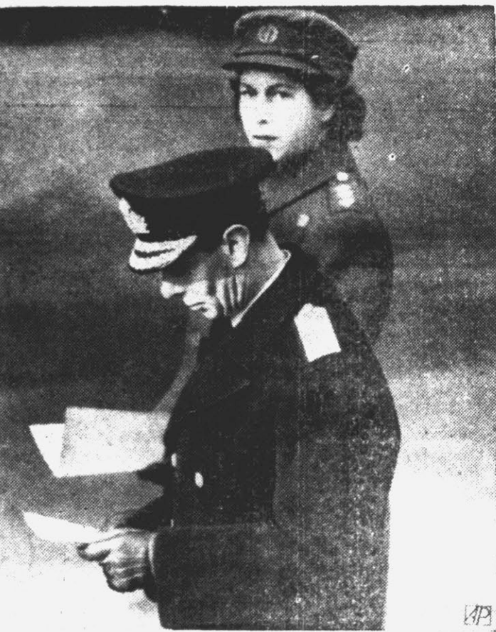
ROYALTY AT SERVICES—King George, and Princess Elizabeth at commencement of religious service in honor of the dead of two World Wars, held at the Cenotaph, London.