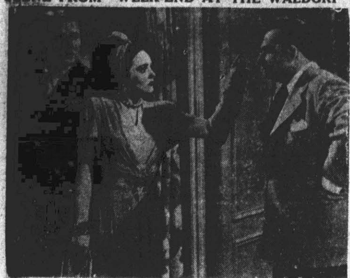
Starring Van Johnson, Ginger Rogers, Walter Pidgeon and Lana Turner, picture opens Tuesday at the Pitt.