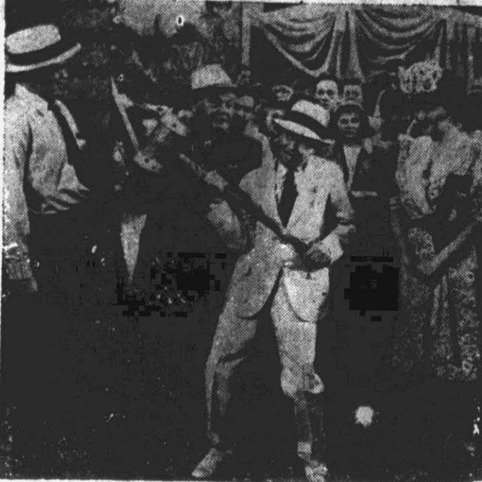
Charles Winninger gives Donald Meek a helping hand. Scene is from "State Fair" gala heart and song treat at the Pitt Theatre today through Thursday.