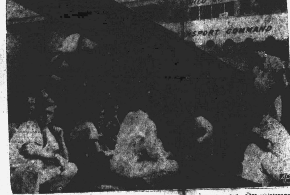
These mechanics, squatting beneath the wing of a plane at Miami, Fla., are some of the 2,000 maintenance workers of Pan American Airways who have gone on a sit-down strike. The strikers checked in as usual at the plant, but sat idly at machines and stations.