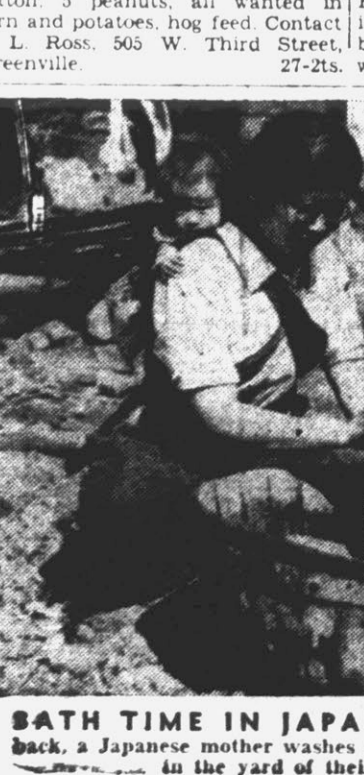
BATH TIME IN JAPAN —With a baby strapped to her back, a Japanese mother washes another child in a tub of water in the yard of their home in Japan.