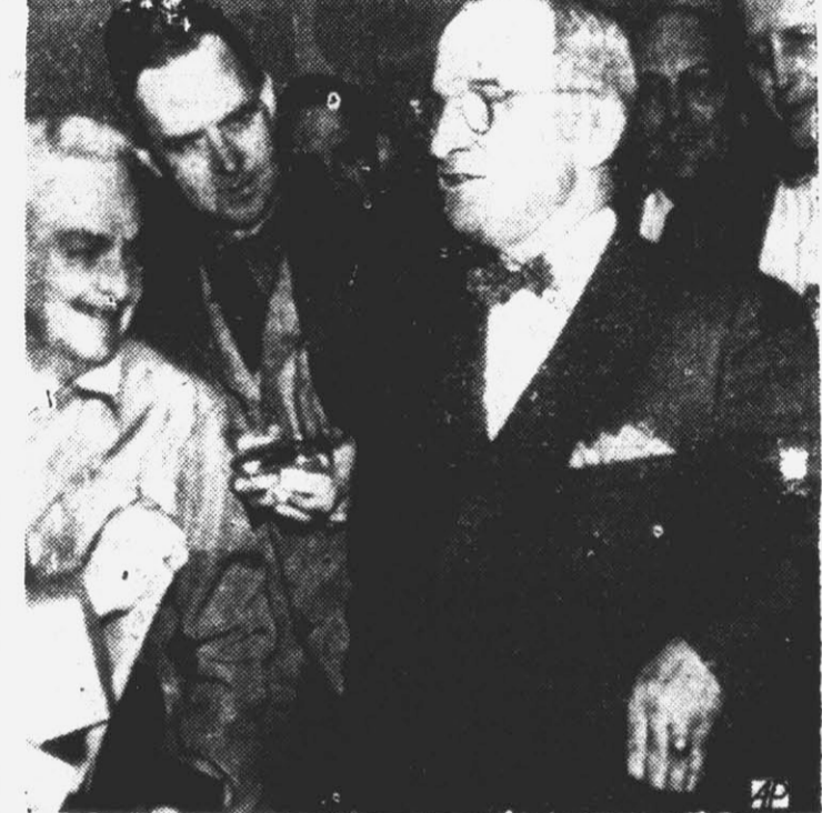
President Truman talks with newspaper correspondents during an informal press conference at his fishing retreat on Reelfoot lake near Tiptonville, Tenn., in which he declared the United States will not share the secrets of the atomic bomb with other nations.

More Pits Closed While Government Officials Try To Get Miners And Operators To Settle Dispute; Labor Secretary Still Hopeful For Agreement