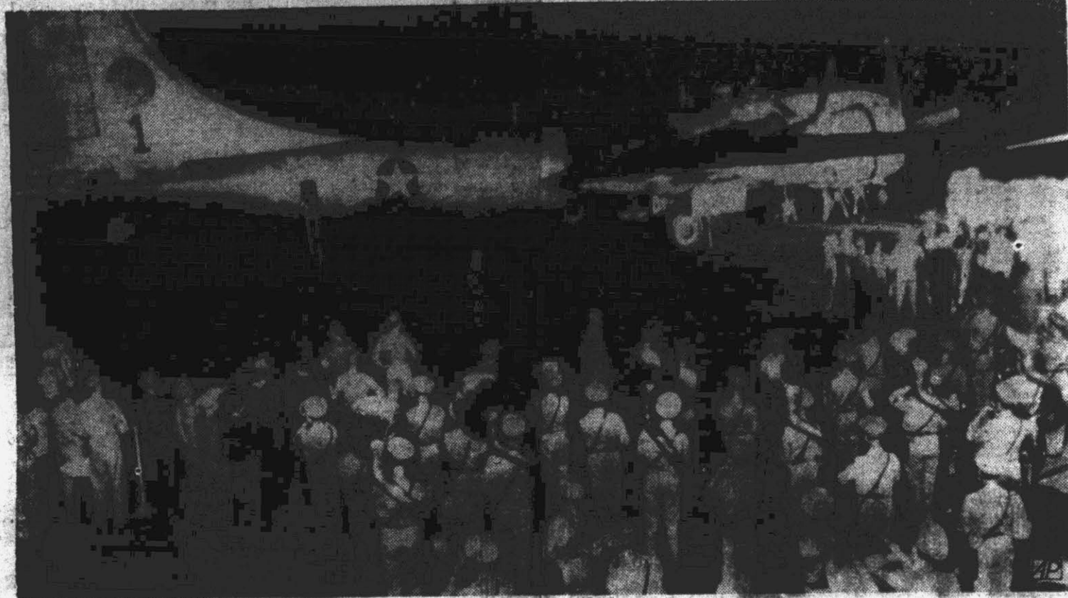
An Army Air Forces band (foreground) serenades crewmen emerging from the B-29 Superfortress commanded by Lt. Gen. Barney M. Giles just after it landed at the National Airport in Washington at the end of a 3,500-mile flight from Japan. The ship was the first of three from Japan to reach the national capital. They intended to make it a non-stop flight, but all were forced to land in Chicago for refueling.