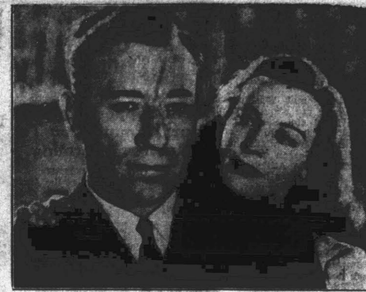
George Raft and Signe Hasso who co-star with Claire Trevor in "Johnny Angel" opening at the Pitt on Sunday.

hour of evangelism, 8:00 p. m. The meeting has been marked by good music and fellowship. The junior choir composed of boys and girls has added to the good singing of the congregation. The congregation and friends of the community are invited to attend these services Sunday.