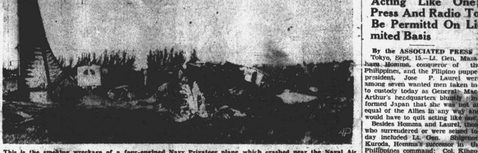
This is the smoking wreckage of a four-engine Navy Privateer plane which crashed near the Naval Air Station in Miami, Fla., Sept. 12 and killed 14 navy men. Its No. 2 engine on fire, the plane was being guided to cleared runways by radio when the crash came. One crewman, W. J. De Roche of Somerville, Mass., parachuted to safety and tried to rescue his comrades from the wreckage, but was driven back by flames and exploding ammunition. (AP Wirephoto).

Crash Of Burning Plane Kills 14 At Miami