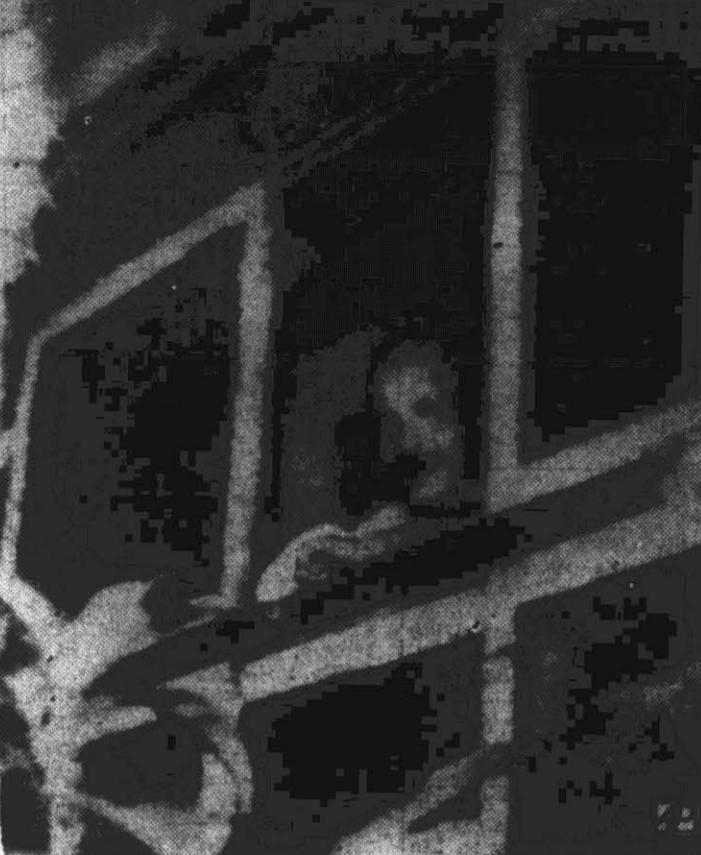
Ex-Jap Premier Hideki Tojo looks out of a window in his home near Tokyo upon American soldiers who had come to arrest him for questioning a few minutes before he shot himself. Charles Gorry, Associated Press photographer with the wartime still picture party, was with the officers, and got this picture.