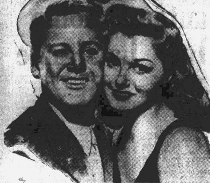
Van Johnson and lovely Esther Williams co-starred in "Thrill of a Romance," Pitt three days starting Tuesday.