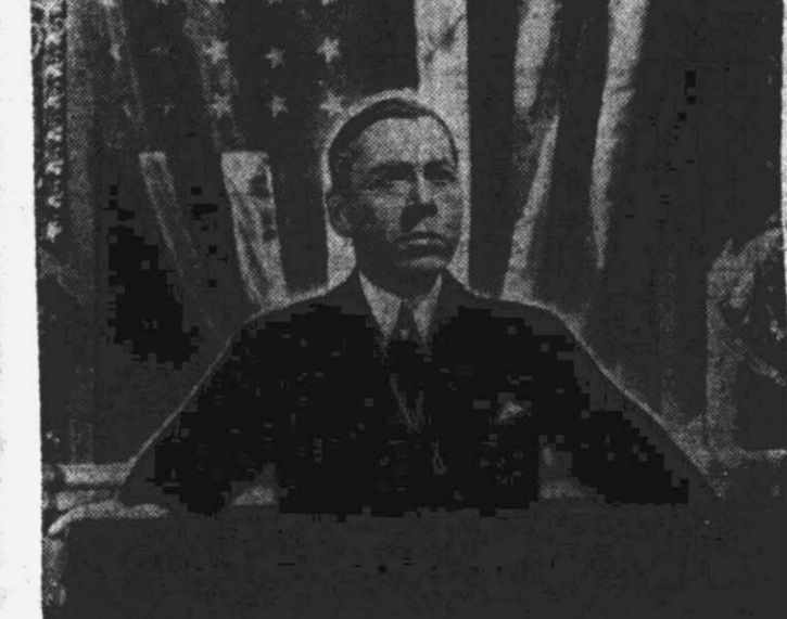
Woodrow Wilson (Alexander Knex) asks for a joint declaration of war in scene from the technicolor production "Wilson" Pitt Tuesday-Wednesday. There will be only four shows daily, starting 12:30, 3:05, 5:55, 8:45.

District Teachers To Meet Raleigh, Aug. 25.—(AP)—District meetings of the Department of Classroom Teachers, North Carolina Education Association, will be held during October and November, association headquarters has announced.