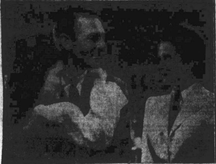
Randolph Scott, Ellen Drew and Ruth Warrick are the principals in "China Sky" opening Sunday at the Pitt.