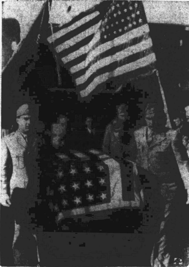
Flanked by flags waving in the breeze, the body of Maj. Richard Bong, American air ace, is removed from a plane at the airport in Duluth, Minn., enroute to his home at Superior, Wis., for burial. He was killed in test-flying a jet propulsion plane at Burbank, Calif.