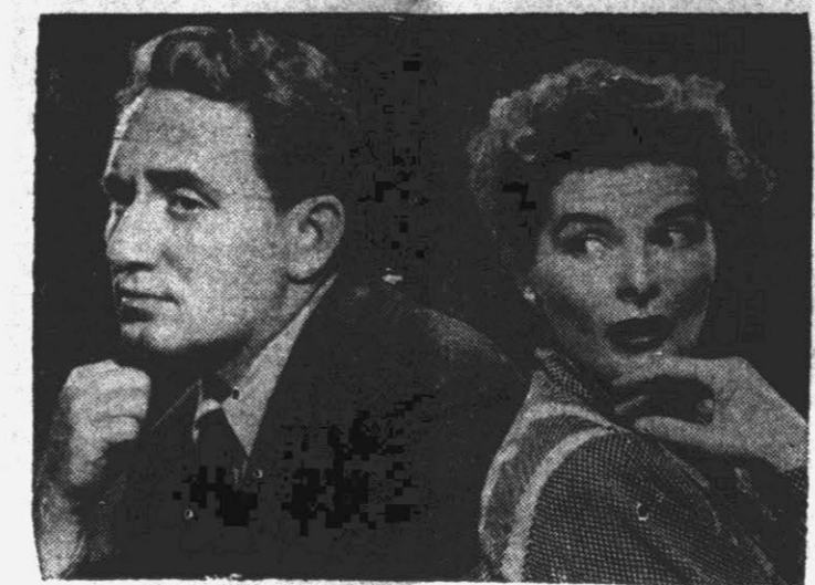
Co-starred in new laugh hit "Without Love" opening Tuesday at Pitt. Cast includes Lucille Ball, Patricia Morison.