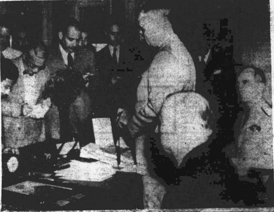
President Truman stands at his desk in the White House as Washington and announces that Russia has declared war on Japan. Secretary of State James F. Byrnes (left) and Adm. William D. Leahy (right), naval chief of staff, are seated around the President. News men stand at left.