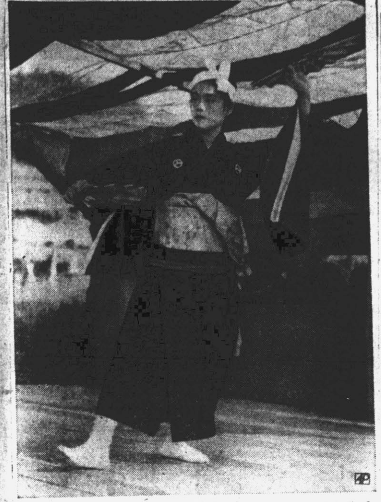
GEISHA ON OKINAWA —At a native dance festival held at Taira, Okinawa, and attended by U. S. Army, Navy and Marine personnel, a geisha girl performs a dance dedicated to "travelers from Okinawa to the mainland of Japan."