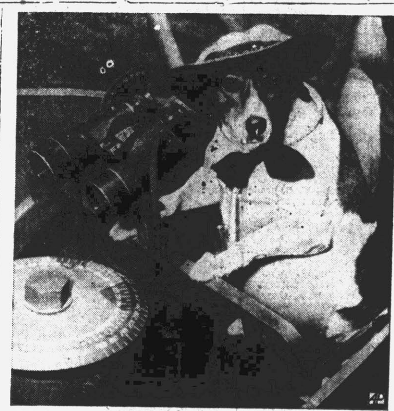
SOGGIE ON WATCH—Decked out like a SPAR for a tour of duty as sky lookout on a combat cutter is Soggie, Coast Guard mascot of nine years' service. Her general quarters station is behind the galley refrigerator.