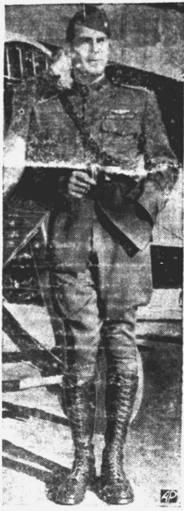
EDDIE —Fred MacMurray, cast as Capt. Eddie Rickenbacker in a film, wears a uniform of World War I, in which Rickenbacker was an ace in the Lafayette Escadrille.