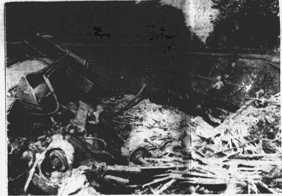
Wreckage of a fast passenger train, the Kansas City-Florida Special, is piled up on the Southern Railway tracks at McGriff, Ga., about 30 miles south of Macon, after plunging into the rear part of a freight train which was pulling from the main line into a siding. Two trainmen were seriously injured but all passengers escaped unhurt. At the left is the overturned locomotive of the passenger train which was running between Kansas City, Mo., and Jacksonville, Fla. (AP Photo).