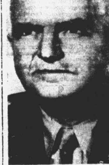
Lt. Gen. Simon Bolivar Buckner, Jr., (above), commander of the U. S. Tenth Army on Okinawa, was killed by a Japanese shellburst June 18 as he sat on a coral rock watching Marine reinforcements strike at Japs fleeing in confusion to Okinawa's southern seashore cliffs. Gen. John W. Stilwell was today named to succeed Buckner as head of the 10th Army.