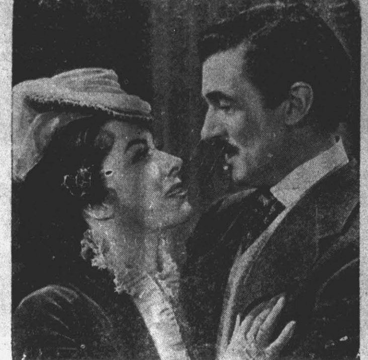
Greer Garson and Walter Pidgeon in the film version of the novel "Mrs. Parkington" comes to the Pitt Tuesday-Wednesday. Shows begin 2:00, 4:23, 6:50 and 9:00 p. m.