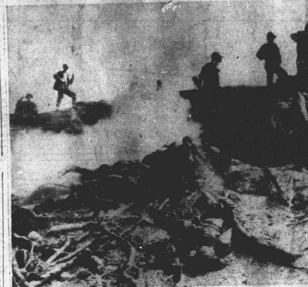
Bodies of Japanese soldiers smoulder on the crest of "Bryant Hill" near Pancan in the hills of Luzon in the Philippines after an American flame thrower silenced a heavily fortified group of 23 Japs in a cave. They had been placed in a strategic position on the hill to resist American mopping-up activities.