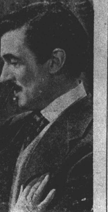
Greer Garson and Walter Pidgeon in the film version of the novel "Mrs. Parkington" comes to the Pitt Tuesday-Wednesday. Shows begin 2:00, 4:23, 6:50 and 9:00 p. m.