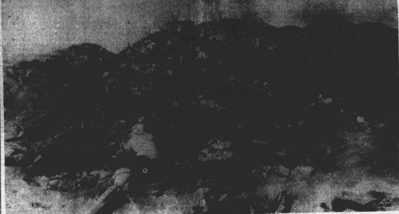
American Marines, invading the Jap stronghold of Iwo Jima island, dig in after taking an "impregnable" enemy pill box (center background). The Marine in the center is digging a fox hole. Lying around are bodies, some in the open, some partly covered by sand. The caption accompanying the picture did not identify them. These are Fourth Division Marines in action February 19.