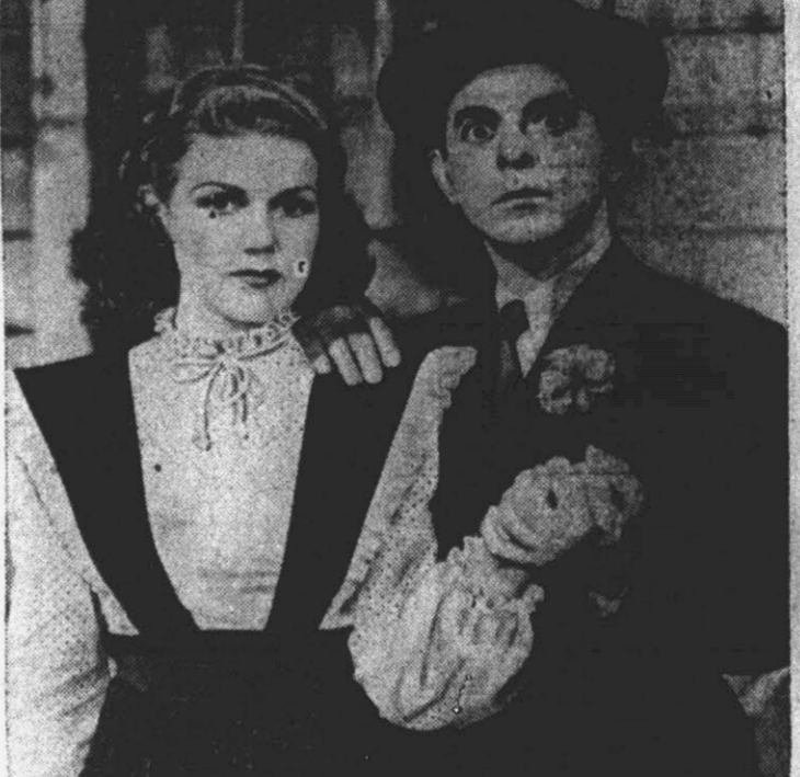
Eddie Cantor and Nora Martin as they sing "We're Having a Baby" in "Hollywood Canteen" star studded musical opening Tuesday at the Pitt Theatre.