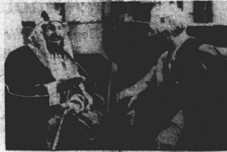
President Roosevelt listens intently as King Ibn Saud (top) of Saudi Arabia talks in French aboard a U. S. warship in Great Bitter Lake near Cairo, Egypt, during a stop-over on the President's way home from the Yalta conference. The king traveled 800 miles and left his native soil for the first time in his life to meet the President. At the bottom, President Roosevelt chats with Emperor Haile Selassie of Ethiopia, another visitor on the warship. This morning, too, took place while the ship was anchored in Great Bitter Lake, a part of the Suez canal.