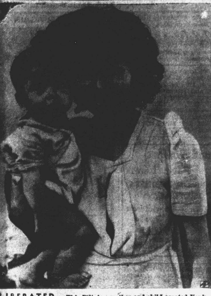
LIBERATED—This Filipino mother and child greeted Yank forces freed Philippines from Jap domination.