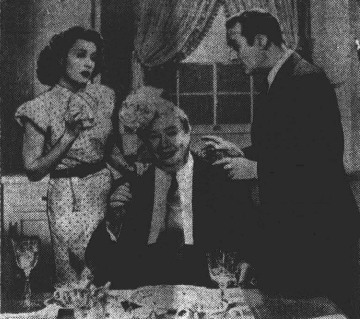
Charles Coburn with Irene Dunne and Charles Boyer in scene from merry romantic comedy "Together Again" opening Tuesday at the Pitt Theatre.

New York Cotton New York, Feb. 10—(AP)—Cotton futures opened 5 to 20 cents a bale higher. Futures closed 25 cents a bale higher to 5 cents lower. March ..... 21.85 21.86 21.84 May ..... 21.72 21.73 21.69 July ..... 21.30 21.27 21.26 Oct. .... 20.64 20.59 20.60 Dec. .... 20.56 20.51 20.52 Middling spot 22.19, up 5.