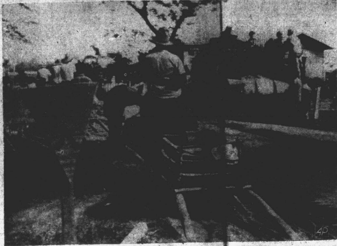
An American tank destroyer enters the town of Capas, north of Manila, as Filipinos leave the area, carrying their belongings on home-made bamboo sleds drawn by carabao.