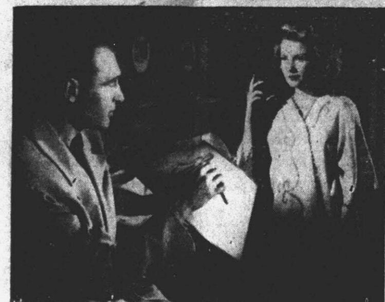
Ralph Bellamy as artist with Anne Baxter in scene from thrilling drama "Guest in the House" Pitt, Sunday-Monday.