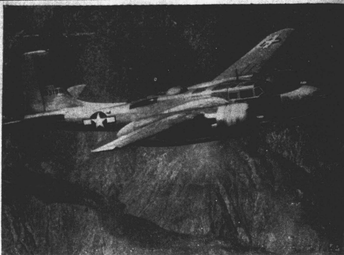
ATTACK BOMBER —The Army Air Forces new attack bomber, the A-26 Invader, flies over undisclosed territory. This ship is made in several models for different theaters.

Becker said he believed the price involved was around $2,800,000.