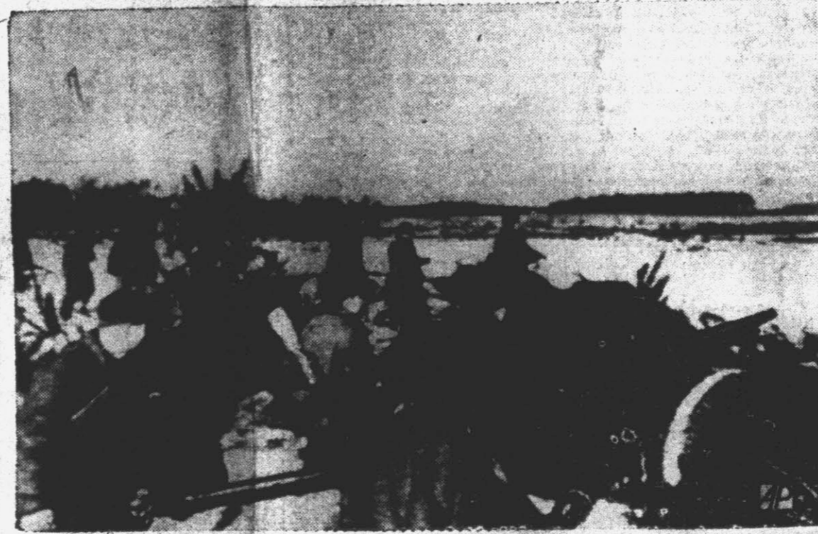
Artillerymen of the Second White Russian army fire in support of infantrymen advancing against the retreating Germans north of the Vistula river in Poland. A dispatch from Moscow said the Russians have crossed the Oder river, last natural defense line standing between them and the heart of Germany.