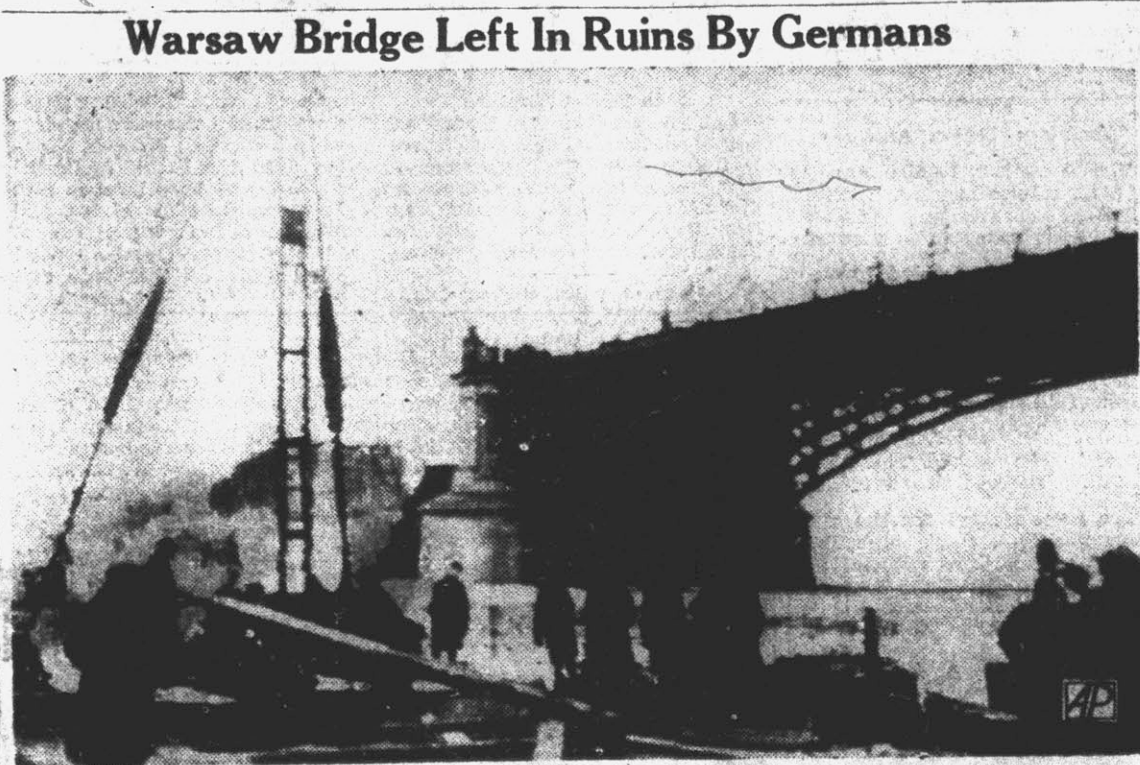
This bridge across the Vistula river in Warsaw was left in ruins by German forces retreating from the Polish capital. Much of the city was destroyed by the Germans before they abandoned Warsaw to the advancing Russians. (AP Wirephoto via radio from Moscow).