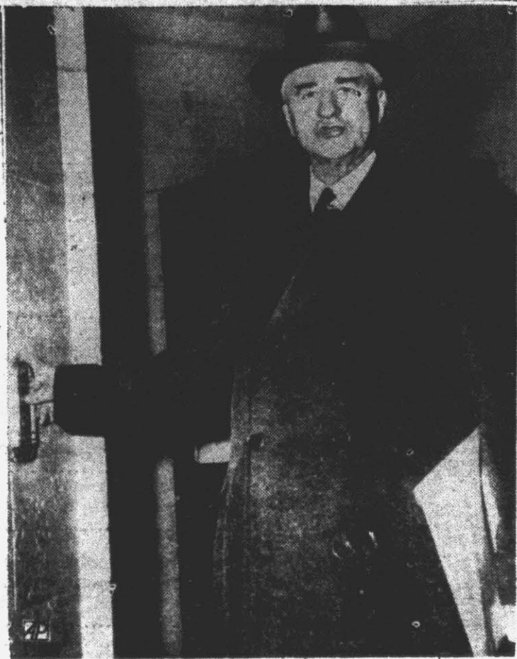
Jesse H. Jones rings for the elevator to return to his hotel apartment from his office in Washington after disclosure that he had resigned as Secretary of Commerce. The 70-year-old Texan resigned at the request of President Roosevelt who intends to give the cabinet post to Henry A. Wallace, retired vice president.