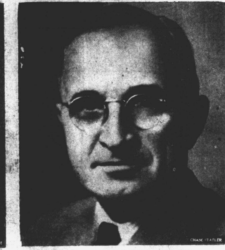
VICE-PRESIDENT HARRY S. TRUMAN

In one of the shortest inaugural ceremonies in history President Franklin D. Roosevelt today became the nation's Chief Executive for a fourth term and Harry S. Truman, former United States Senator, took the oath of office as Vice-President. In his inaugural address that set a record for brevity President Roosevelt declared that "We shall work for a just and durable peace as today we work and fight for a total victory in war."