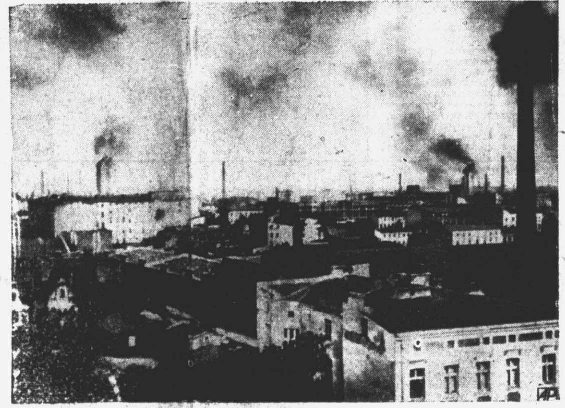
Above is a panoramic view of Lodz, second largest city of Poland, with its great industrial plants. Lodz, 70 miles southwest of Warsaw, has been entered by the Russians in their latest drive, according to admission from Berlin. The loss of the city is another blow to Germany's war production efforts.