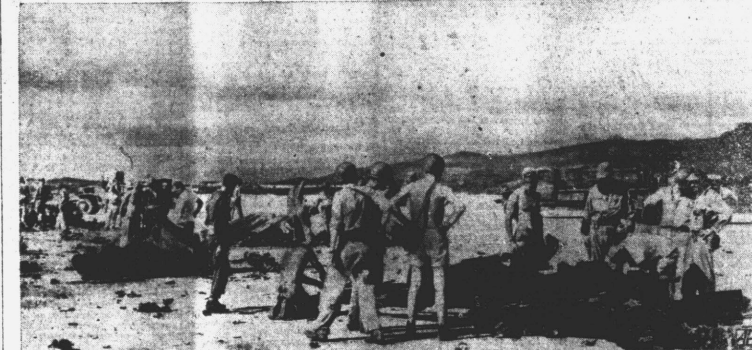
JAP ATTACKER BLASTED ON SAIPAN —Wreckage of one of 16 Japanese planes which raided the B-29 base of the USAAF 21st bomber command on Saipan litters the airfield. Only three of the attacking planes escaped destruction.