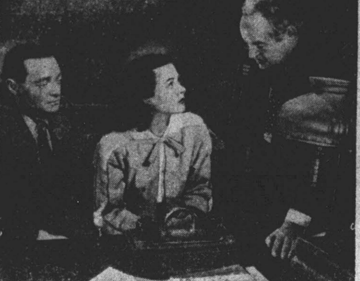
Hedy Lamarr seems to have the odds against her with Sydney Greenstreet and Peter Lorre closing in on her from both sides in the above scene from exciting new drama "The Conspirators" coming to the Pitt Sunday, Monday.

hardest ground we ever fought over." With slow, steady gains on a 17-mile front on the north side of the salient, Lt. Gen. Courtney H. Hodges' U. S. First army in its three-day-old attack had whittled down the German escape way between Bastogne and Grandmenil to barely 12 miles. On the south side of the salient held by three German armies, Lt. Gen. George S. Patton's Third Army turned back 17 fierce German counterattacks up to 6 a. m., today, but The U. S. First army to the east meanwhile knifed through drifting snow and fog which reduced visibility to almost zero and scored several gains of 1.5 to 2 miles along a 17-mile front. Arbrefontaine, 21-2 miles from the Larothe-St. Vich highway, on the left flank of the First, was cleared after a street fight. Advances of 1,000 yards were marked up the outskirts of Lierneux farther west, and below Hottin, on the right wing of the First, a German counter-attacking force was wiped out at Bergeval on the left flank near Stavelot. It was hard going, however, and a staff officer at Montgomery's headquarters declared "This is the