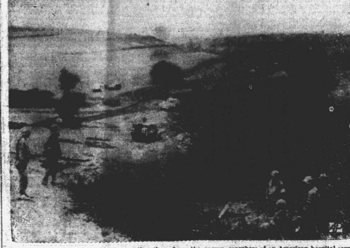
Close behind the single ridge separating them from the enemy, members of an American hospital corps unit set up a battalion aid station for speedy treatment of the wounded. Some of the unit's vehicles are visible nearby. Location of the station was not disclosed, except that it is somewhere in the European theater.