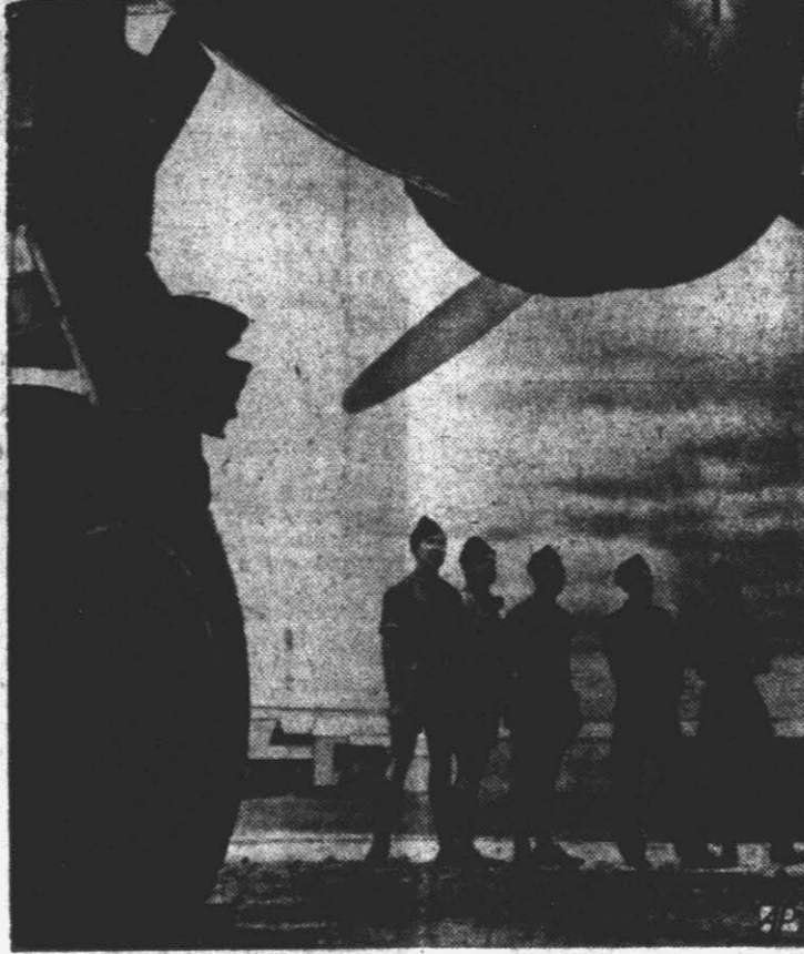
LOOKING OVER BIG PLANE —Young men in the RAAF Air Training Corps look over the converted Liberator bomber—the Commando—with which air freight service was inaugurated between London and Sydney, N.S.W.