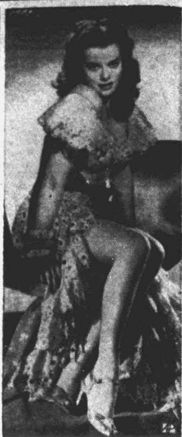
PIN-UP —This photo of Janis Paige, movie actress, was one of six pin-ups requested by U. S. bomber crews on Saipan.