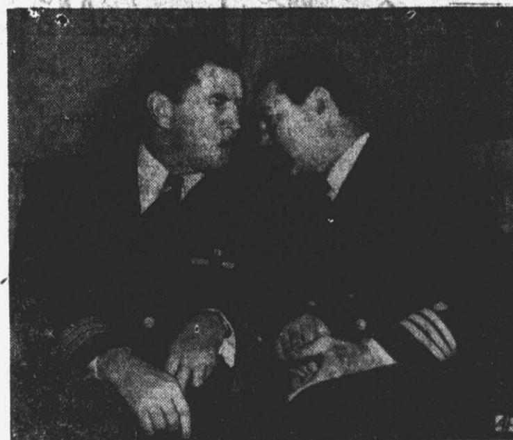
EX CHAMPS MEET — Comdr. Gene Tunney, USNR (left), and Comdr. Jack Dempsey, USCGR, former heavyweight boxing champions, chat at a meeting in Washington, D. C., planning a post-war sports stadium for the capital.