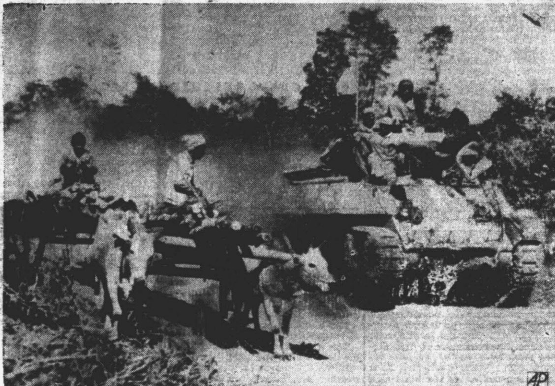
A light tank manned by American-trained Chinese passes an ox cart as it rolls toward the front in northern Burma. This picture was released by the Chinese Ministry of Information.