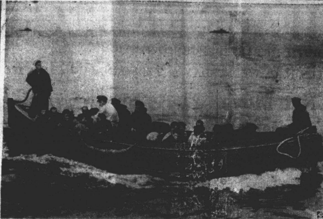
B-29 CREW RESCUED AT SEA - Crewmen of a Saipan-based Superfortress, picked up by a Navy destroyer after 11 days on rafts, are shown being transferred from ship to shore.